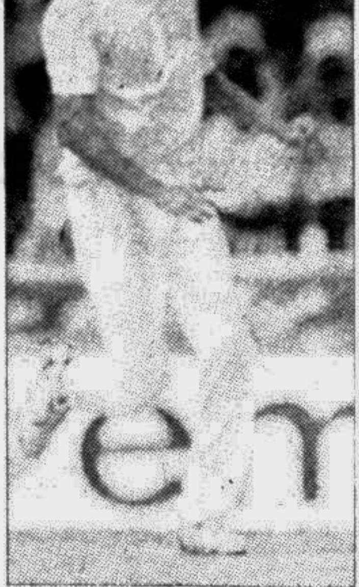
McGrath... 4 for 43