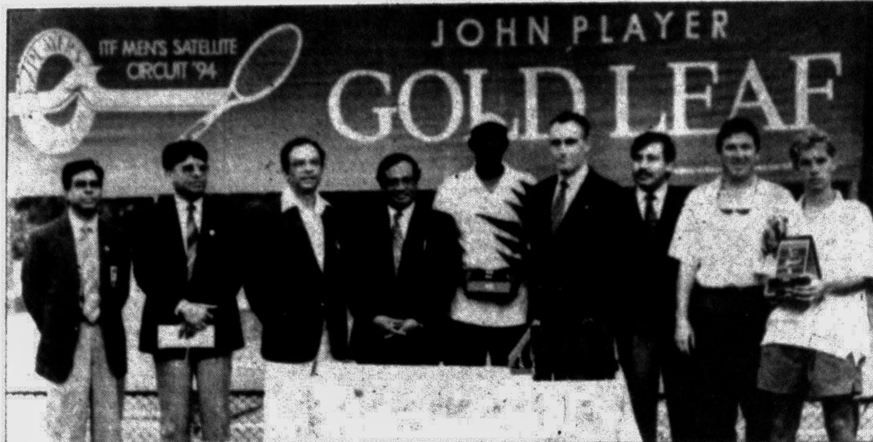
Housing and Public Works Minister Barrister Rafiqul Islam Miah is seen among the winners and organisers of the Gold Leaf ITF Thailand-Bangladesh Satellite Circuit tennis tournament at the Ramna Tennis Complex yesterday.