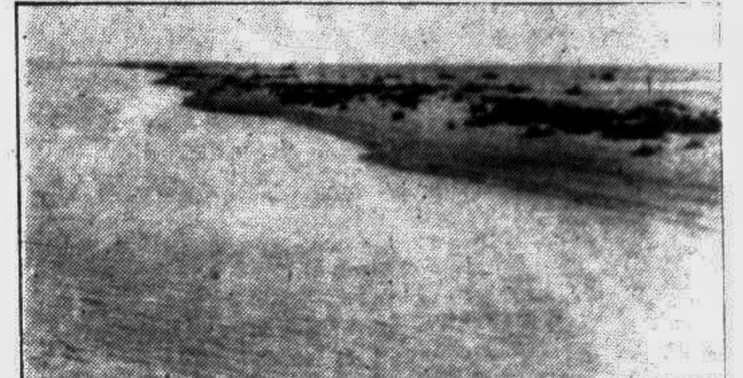
New charland emerged in the river Meghna in Chandpur.

A large number of cases were filed by rival claimants of the chars remain pending in the courts for years. These unsettled litigation also contribute to the violence in the char areas.