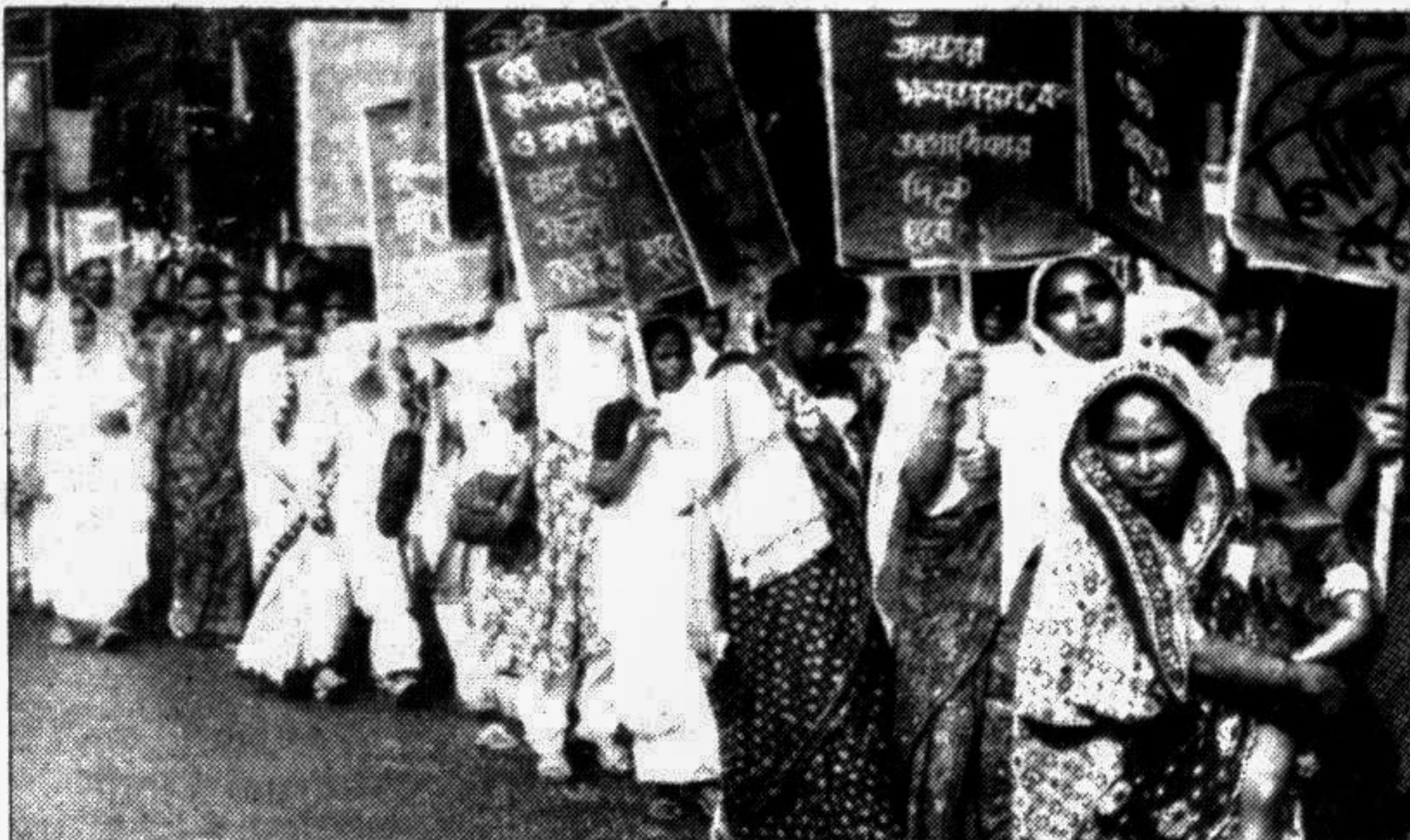
The World Human Rights Day Joint Observance Committee brought out a procession in the city yesterday to mark the Human Rights Day '94.

The maestro has been sponsored by the Italian embassies and the Cultural Ministry of Italy on his foreign trips.