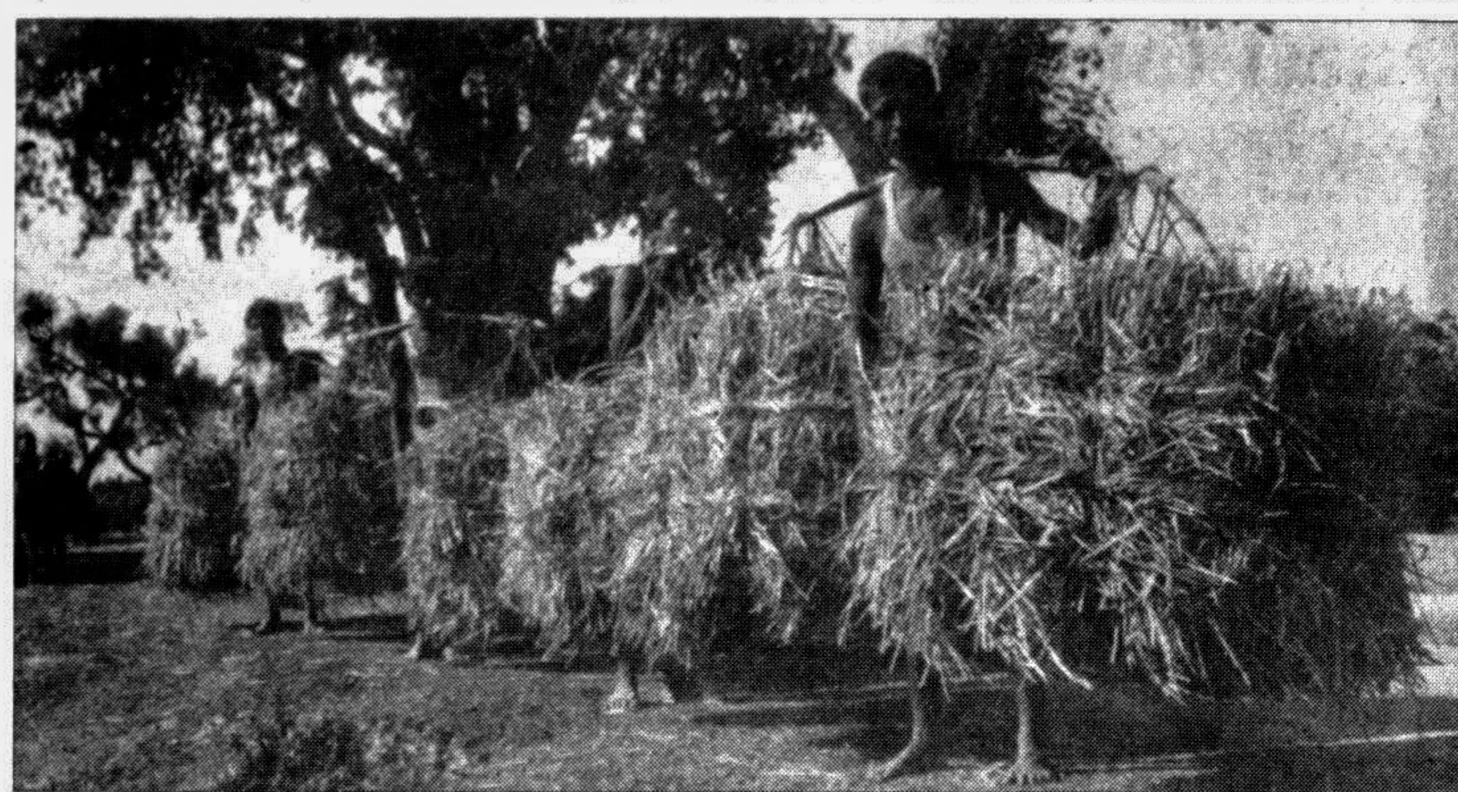
SIRAJGANJ: Production target of aman paddy could not be achieved in the district due to continuous drought. The photo shows the farmers of Tarash thana carrying home paddy. They were happy with whatever they could take home.