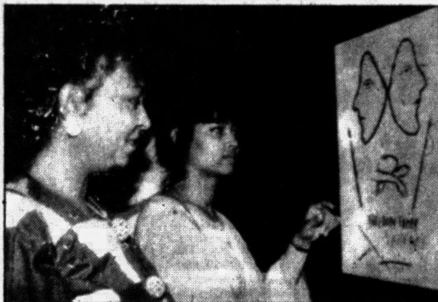
Visitors at a poster exhibition of Santu Saha at the Alliance Francaise in the city which began yesterday.

These are oddities in human character, which make life spicy.