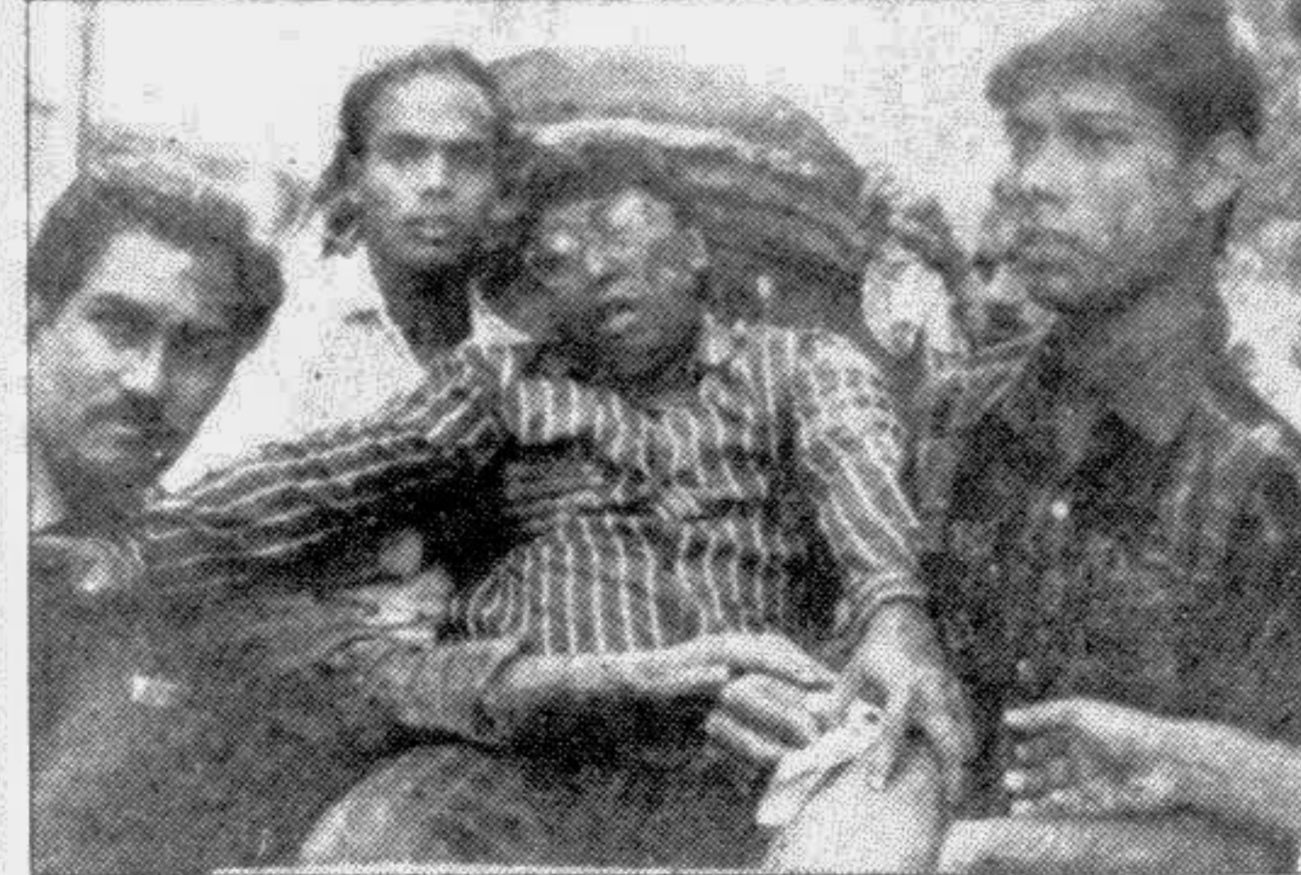
A man injured in a bomb explosion during yesterday's hartal near the Jatiya Press Club being taken to hospital.