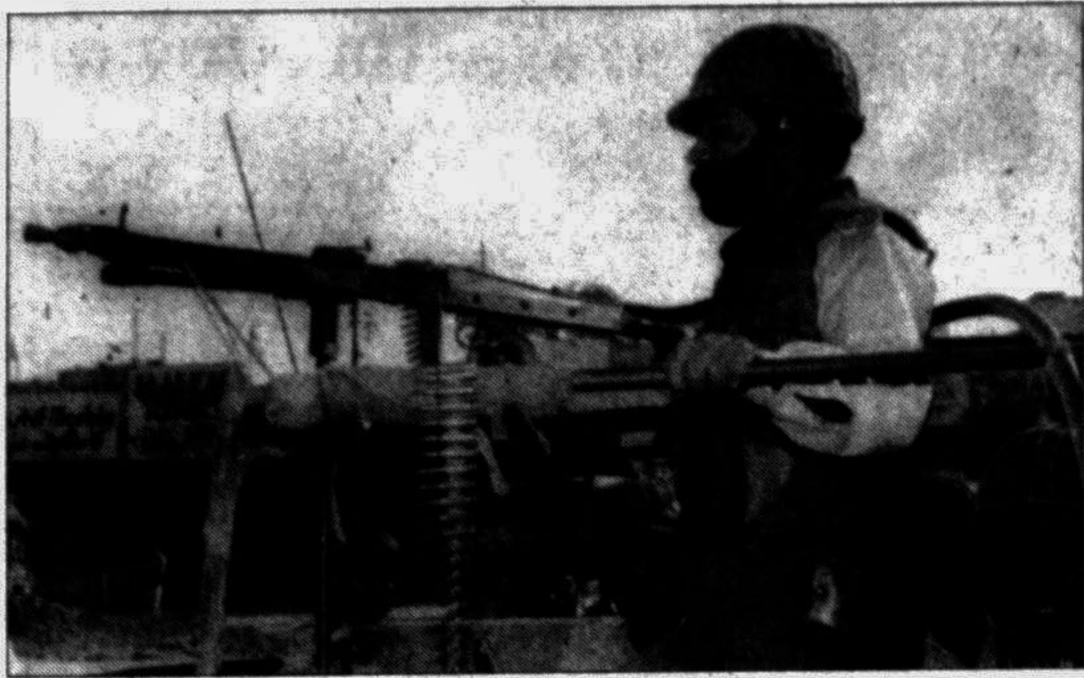
Pakistani para-military rangers patrol the street in Karachi following overnight attack on mosque which left eight people dead yesterday.