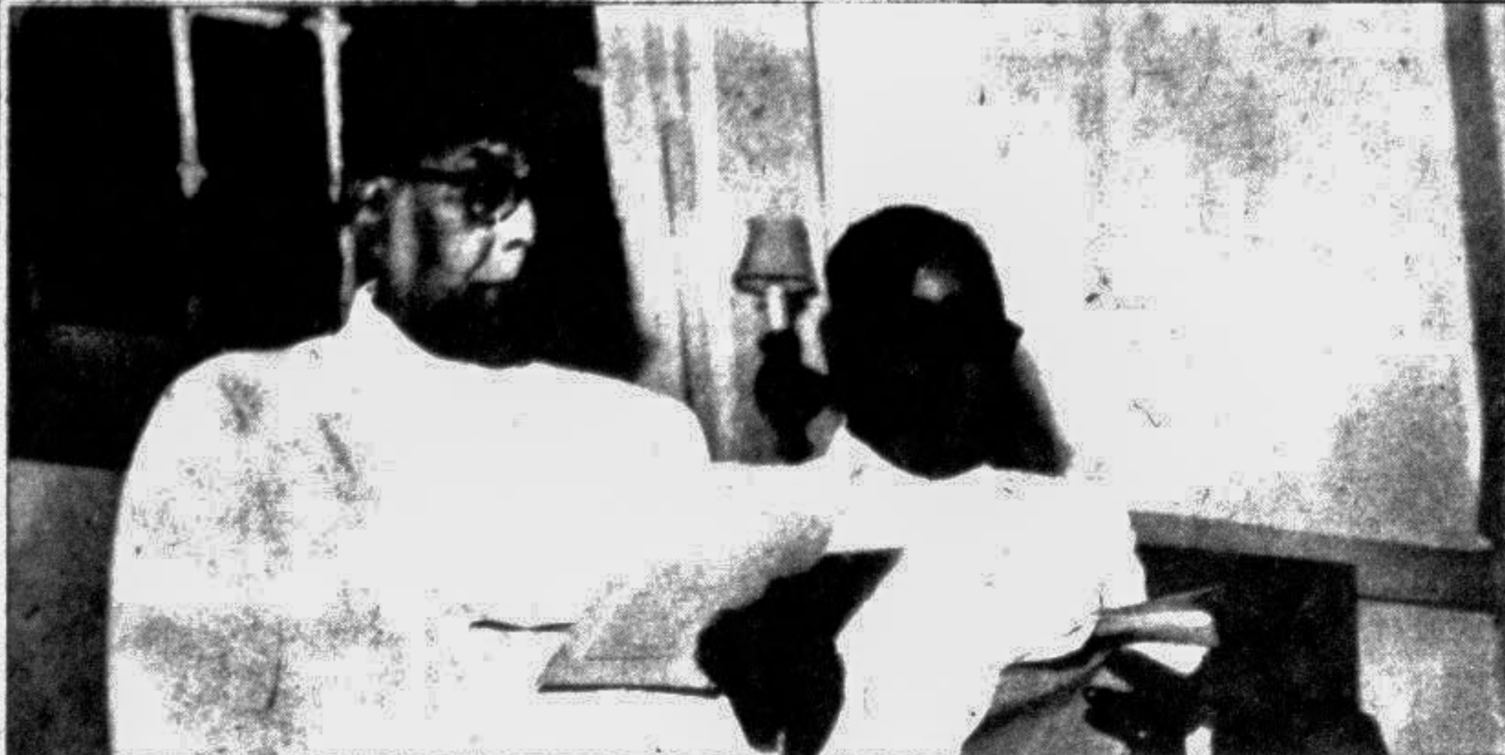
File photo shows Sher-e-Bangla A K Fazlul Haque, Governor of the then East Pakistan administering the oath to chief minister Aatur Rahman Khan in September, 1956.

The third death anniversary of Aatur Rahman Khan, a former prime minister of Bangladesh, is being observed today, belatedly because of the hartals on Wednesday and Thursday. Khan died on December 7, 1991.