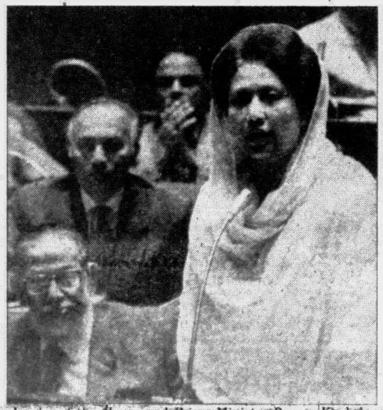
Leader of the House and Prime Minister Begum Khaleda Zia delivering her winding up speech at the 17th session of the Jatiya Sangsad before its prorogation yesterday.

By Staff Correspondent Leader of the Jatiya Sangsad (JS) and Prime Minister Begum Khaleda Zia has once again called upon the boycotting parliamentary opposition to return to the House and resolve the present political impasse through discussion. The Prime Minister gave the call in her 77-minute speech in the House before the prorogation of the 17th session of the present Parliament yesterday evening. The Opposition has the right to agitate to press home any logical demand, the Leader of the House noted and urged them to refrain from 'disruptive programmes' like hartals, sieges and work stoppages for the sake of a better future of the nation. 'Let us unitedly resolve the political impasse within the framework of the Constitution—the country's supreme law, let us solve the problems by ourselves', the Prime Minister appealed. 'We have fought the liberation war unitedly and by ourselves, we have ousted an autocratic regime from power unitedly and by ourselves, we have even switched over to parliamentary democracy unitedly and by ourselves, then why not we resolve the present crisis by ourselves', the Leader of the House said. See Page 8 Col 7