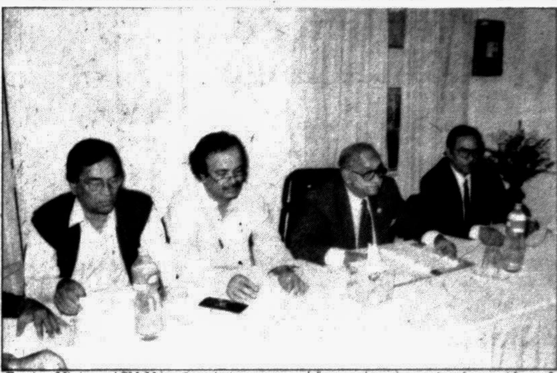
Foreign Minister ASM Mostafizur Rahman (second from right) who is also the president of the Bangladesh Cricket Control Board addressing a press conference yesterday in connection with the forthcoming SAARC cricket tourney to be held in Dhaka.

Two other thorny issues need to be decided by the AFC at the four-day meeting which starts next Monday.