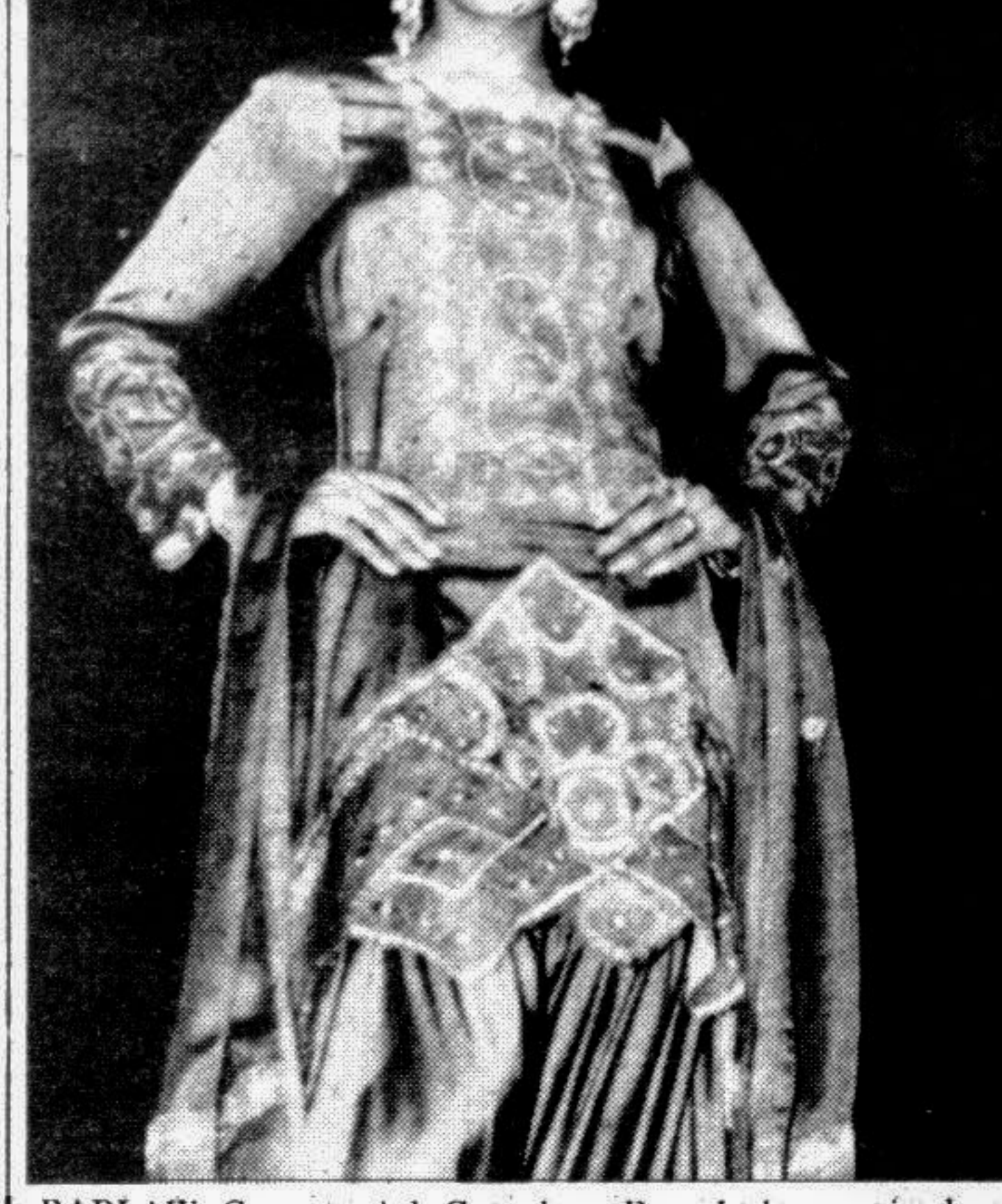
BARLAW Commercial Complex (Pvt) Ltd organised a fashion show in observance of the Tourism Month '94 at Dhaka Sheraton Winter Garden in the city yesterday.

In observance of the Tourism Month '94, a handicraft exhibition and a cultural show were held at Barisal District High School on Monday, reports UNB.