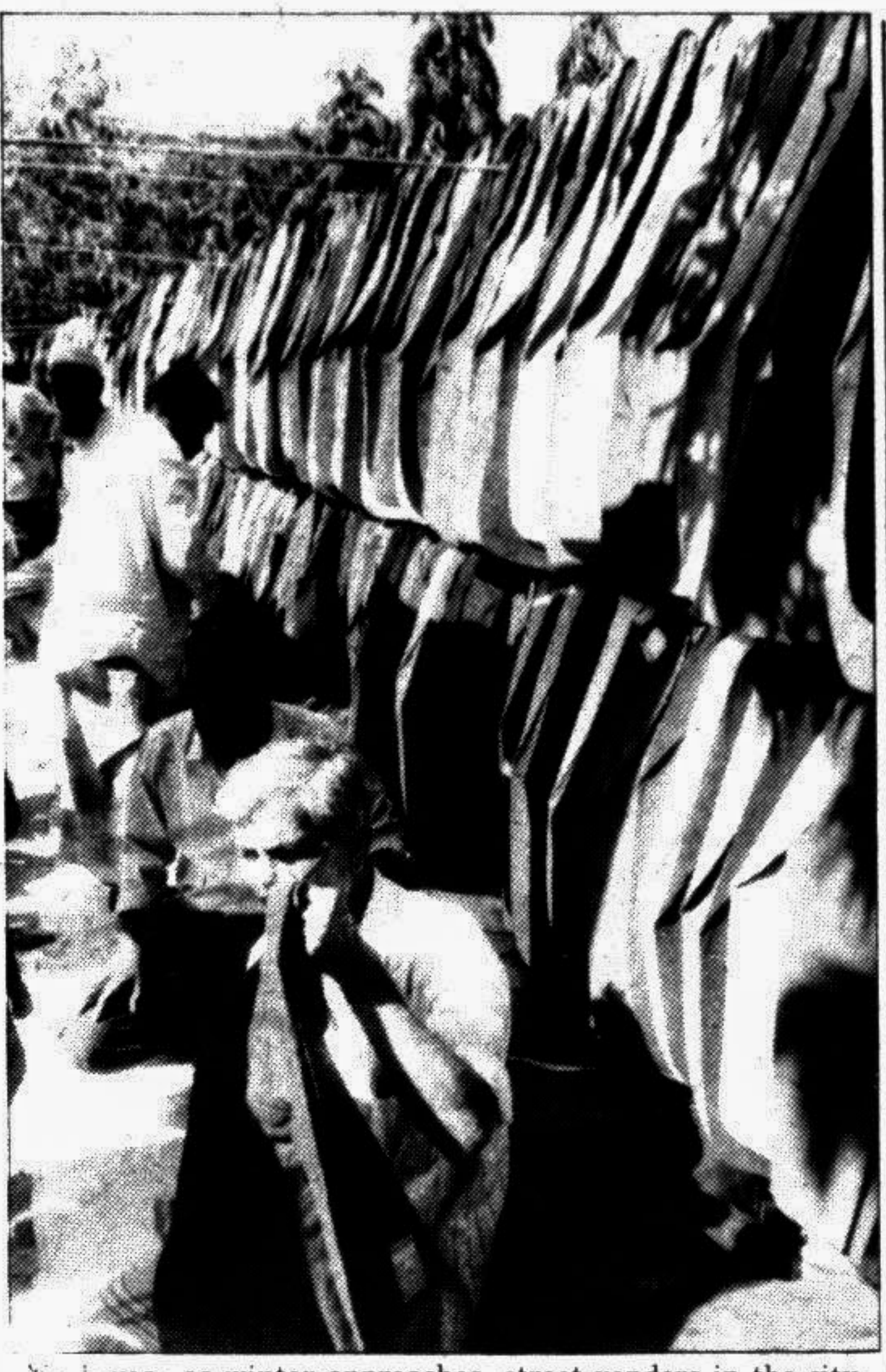
Each year as winter approaches, street vendors in the city, as elsewhere in the country, are seen busy selling out different types of warm apparel among the less fortunate middle-class and poorer segment of the society at a comparatively cheaper price. Picture shows customers buying coat on the pavement beside GPO yesterday each piece costing about Taka one hundred to two hundred only.

Bangladesh Sugar & Food Industries Corporation Tender Notice Sealed tenders are invited from bonafide Suppliers/Manufacturers by Bangladesh Sugar and Food Industries Corporation, Adamjee Court (5th floor), 115-120, Motijheel Commercial Area, Dhaka for import of "Nickel Screens for Continuous Centrifugal Machines" to be used in Sugar Mills.