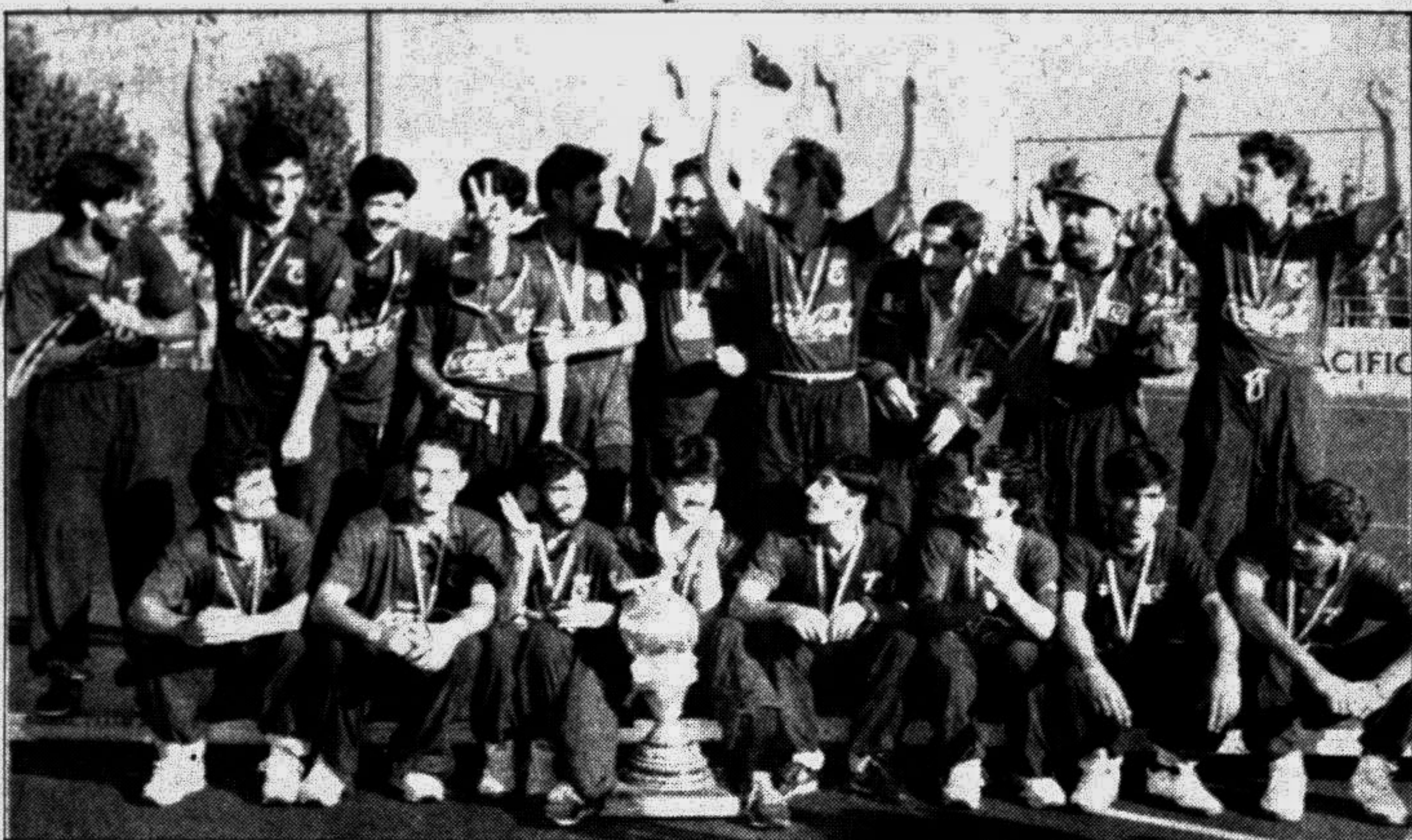
WE ARE THE CHAMPIONS: The victorious Pakistan hockey team celebrates their fourth World Cup after defeating defending champions, and tournament favourites, the Netherlands in Sydney yesterday. Pakistan won 4-3 on penalties after the final ended in a one-all draw.