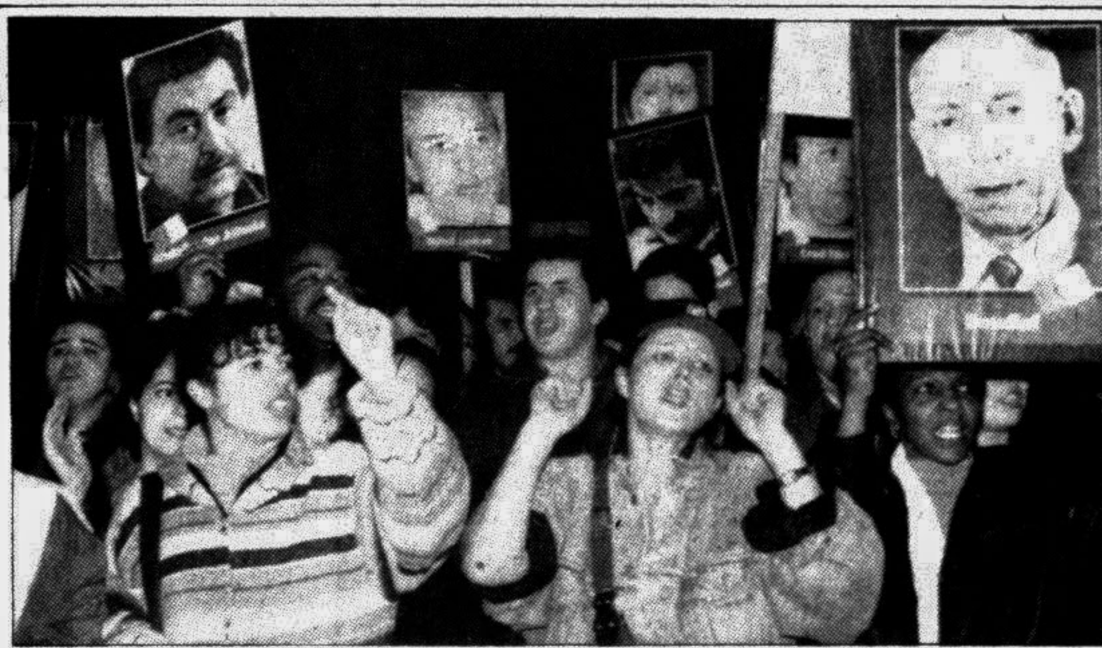
People carrying pictures of the victims of violence in Algeria in Paris on Saturday. About 10,000 people participated in the demonstration for freedom and democracy in Algeria.

Udugov said Chechen authorities were already setting up partisan bases around the wild mountain territory "with enough food, ammunition and weapons for a year."