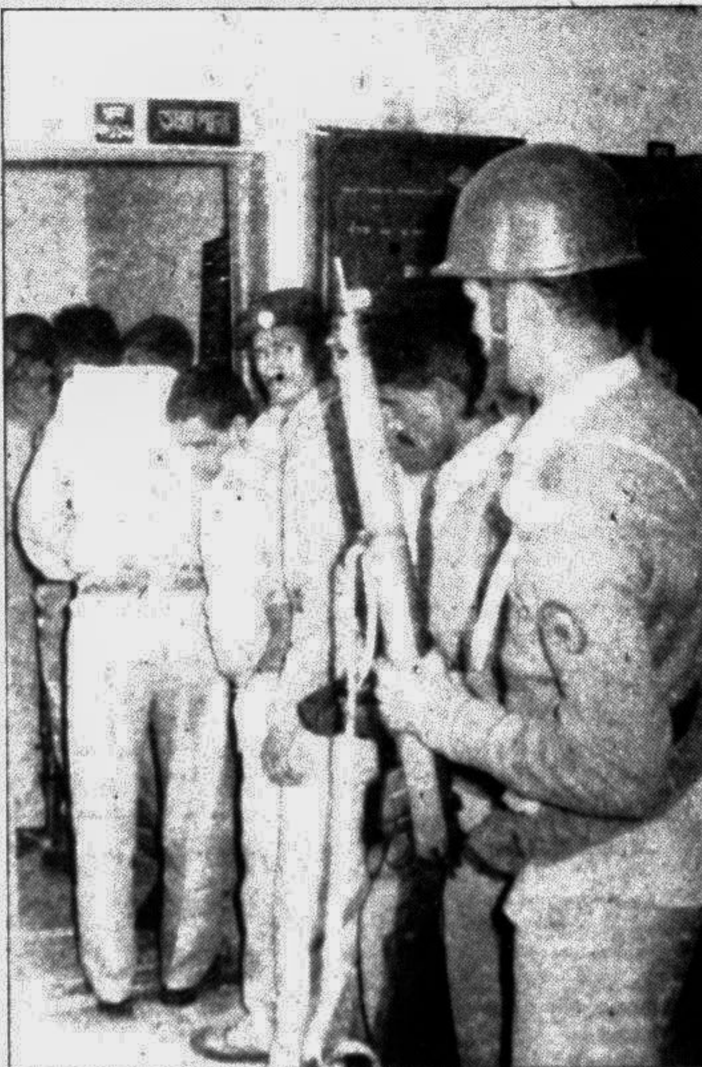
Members of the Battalion Ansars depositing their arms at the Ansars headquarters at Khilgaon in the city yesterday.