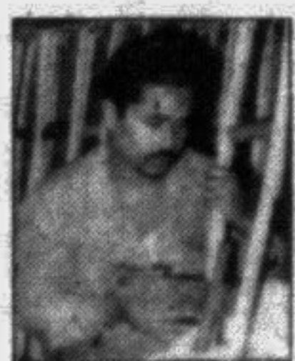
They Help Where Legs Fail Page 3