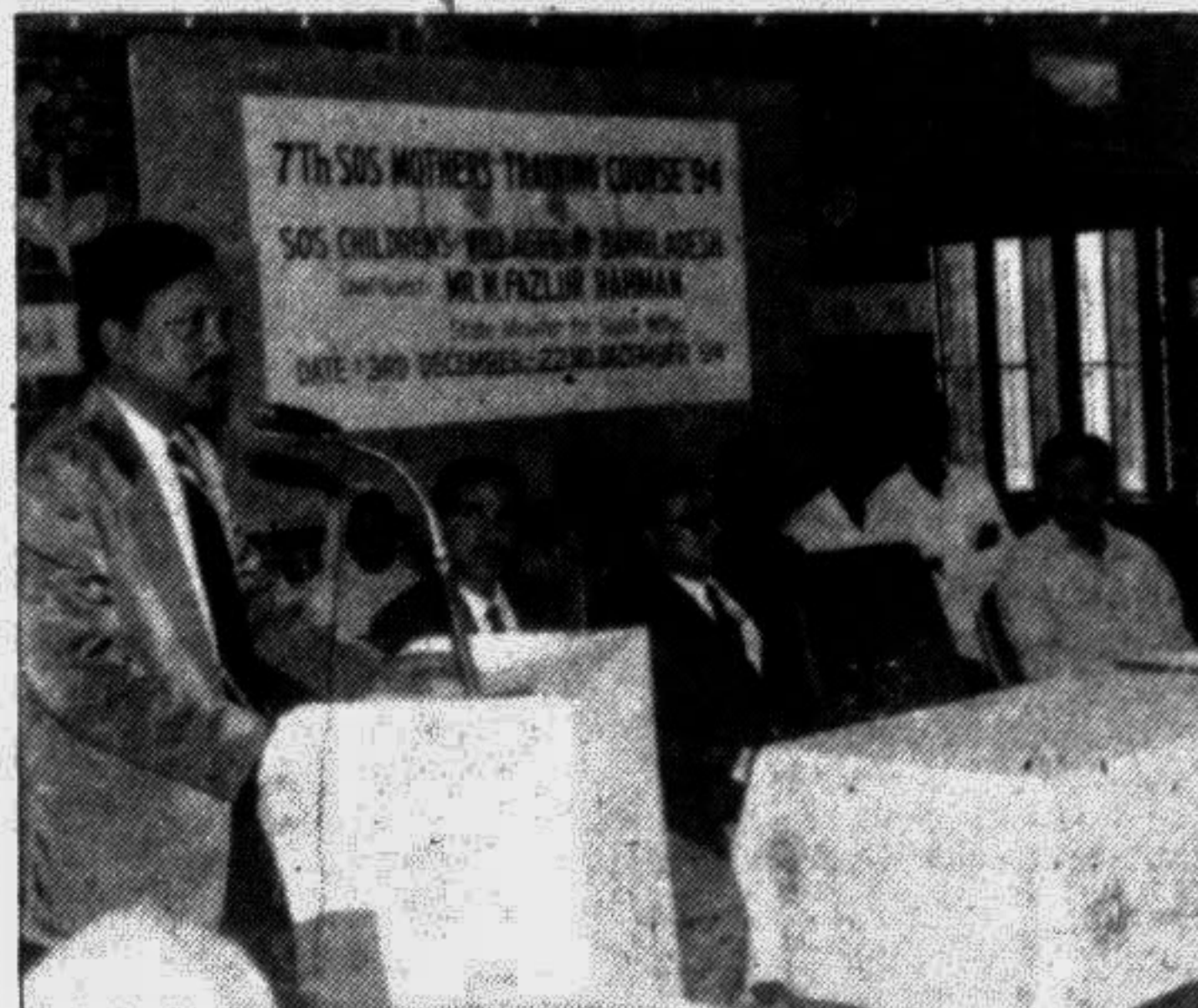
State Minister for Social Welfare Fazlur Rahman addressing the inaugural of the seventh SOS mothers' training course in the city recently.

Candlelit remembrance programme: The Narecpakha, a women organisation, will hold a candlelit remembrance programme to mourn the martyrs of country's War of Liberation. Venue: Kendriya Shaheed Minar premises. Time: From 5 pm to 6 pm.