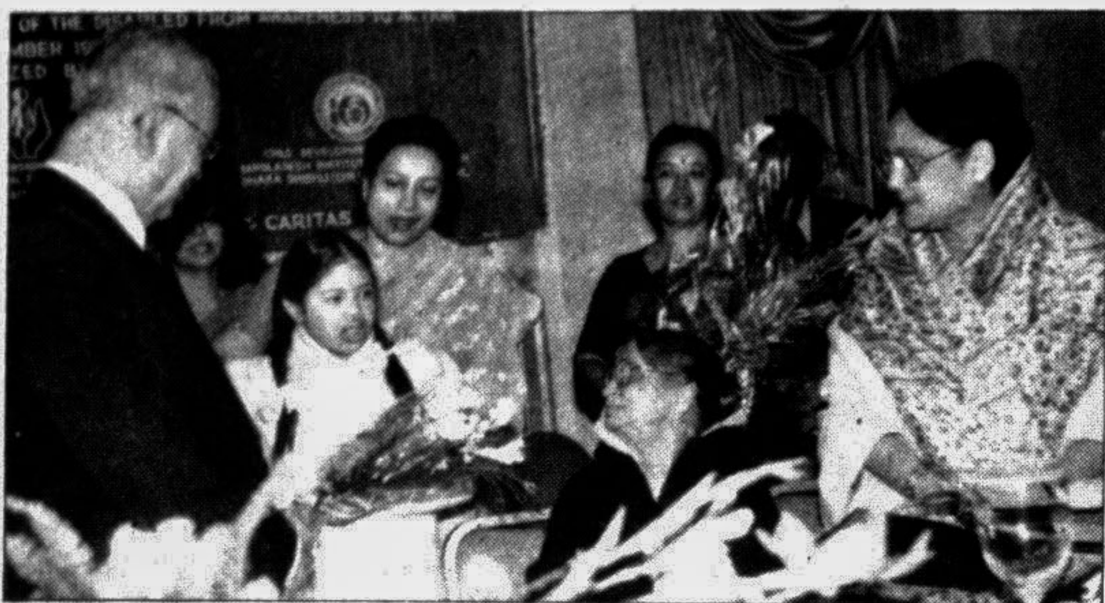
A retarded girl presenting a bouquet to poet Sufia Kamal at a regional seminar on 'Childhood Disability' held at the Sheraton Hotel in the city yesterday. President Abdur Rahman Biswas (extreme left) and State Minister for Women and Children's Affairs Sarwari Rahman (far right) look on.