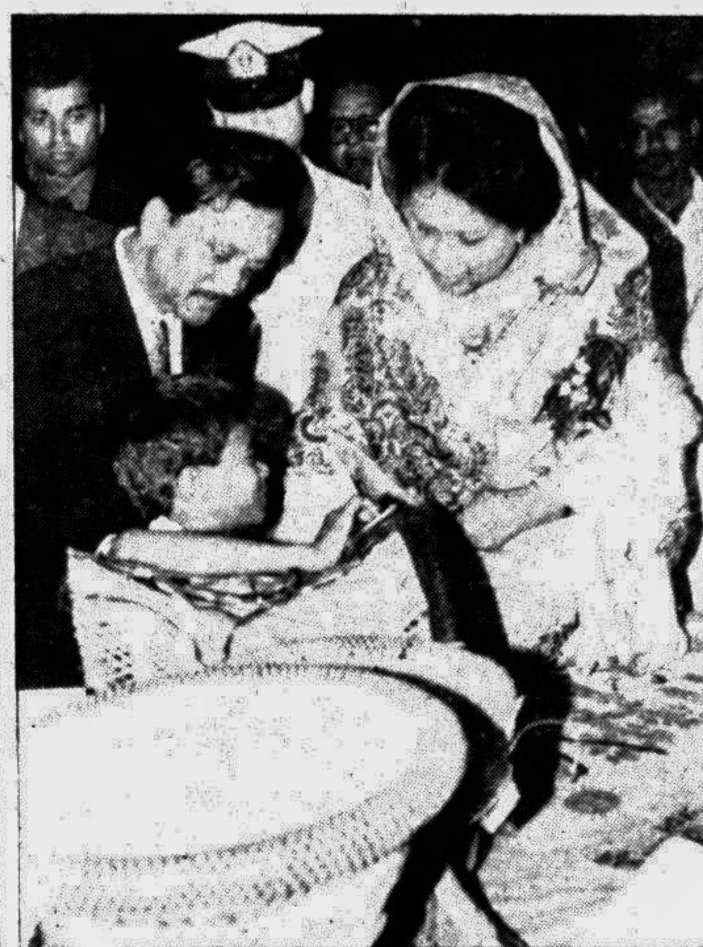
Prime Minister Begum Khaleda Zia looking at a work done by a disabled boy at the handicraft exhibition held at Osmani Memorial Hall in the city on the occasion of the International Day of the Disabled yesterday.