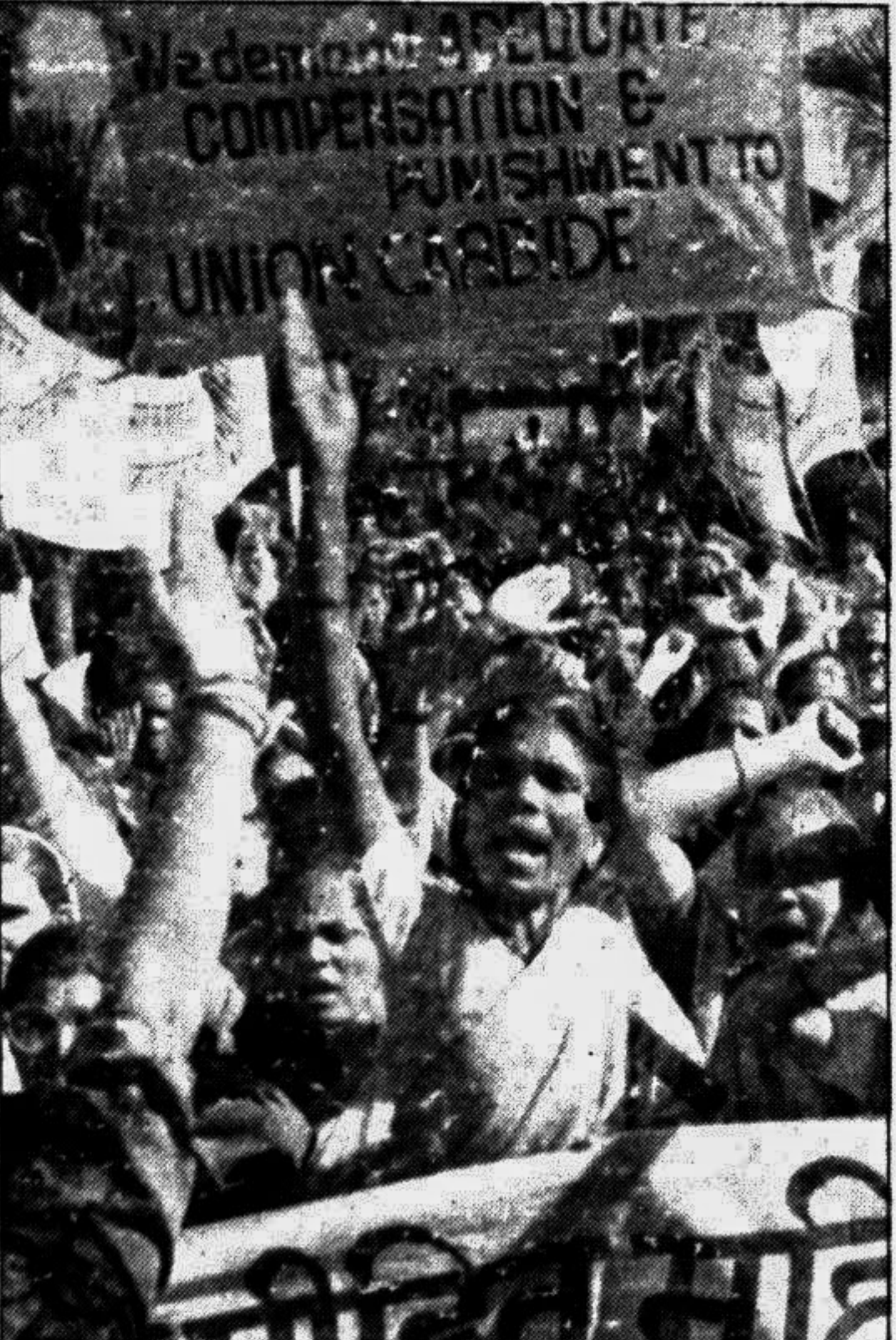
Hundreds of women affected by the 1984 Bhopal gas disaster demonstrate in Bhopal, India, yesterday demanding compensation on the eve of the 10th anniversary of the tragedy.