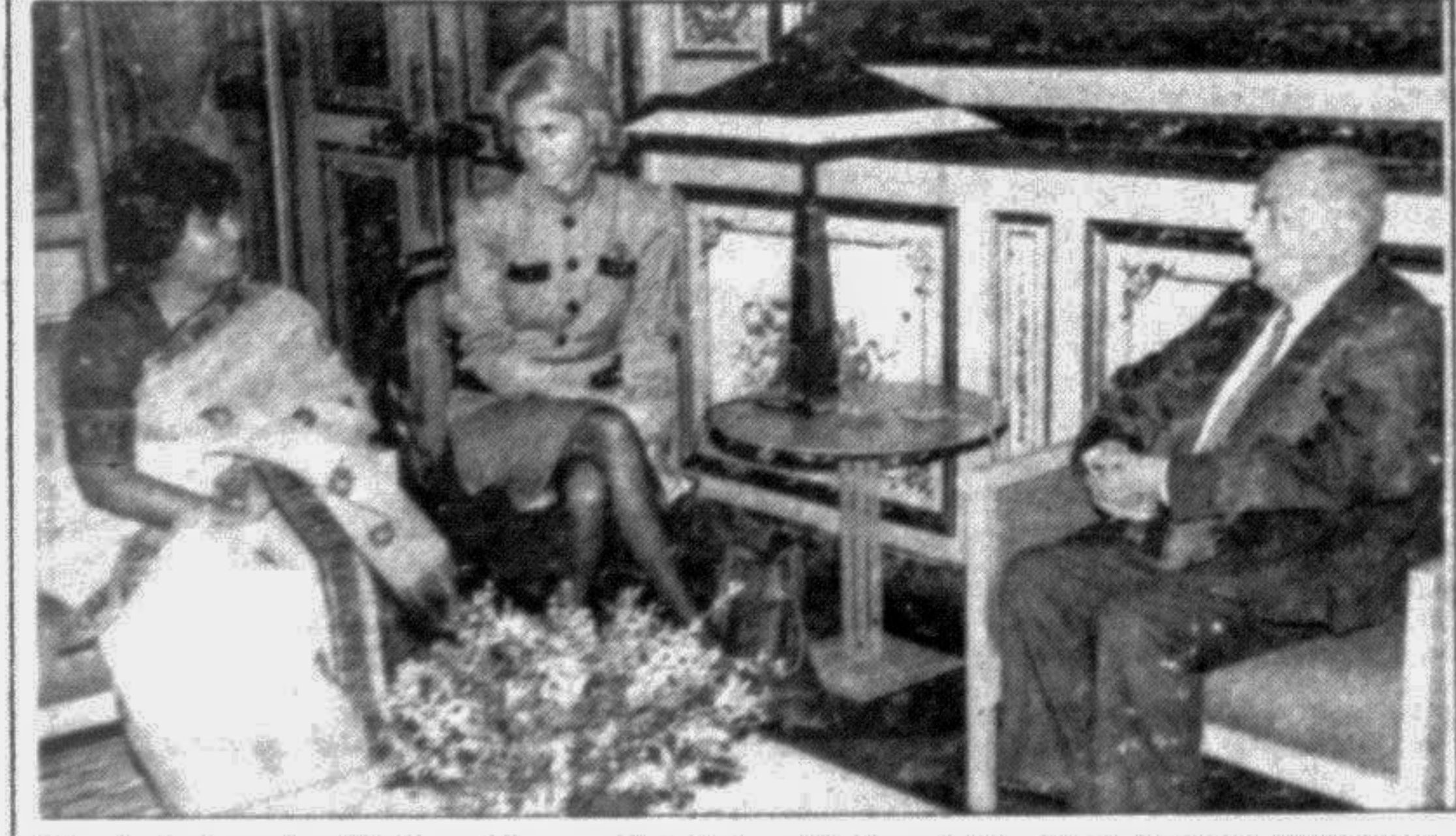
Bangladeshi writer Taslima Nasreen (L) chats with French President Francois Mitterrand Thursday in Paris. The French government granted Nasreen a human rights award on November 30.