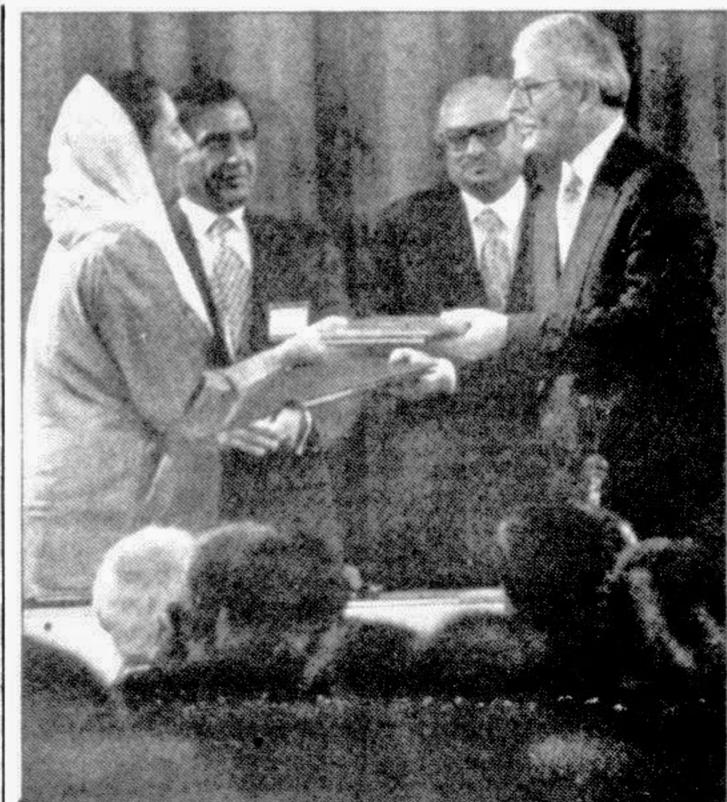
Pakistan's Prime Minister Benazir Bhutto exchanges documents with British Prime Minister John Major after they signed the Investment Promotion and Protection Agreement between the two countries. The ceremony was held at a conference 'Pakistan Today' organised by the Confederation of British Industries (CBI) in London on Wednesday. Bhutto is on a six-day official tour of UK.