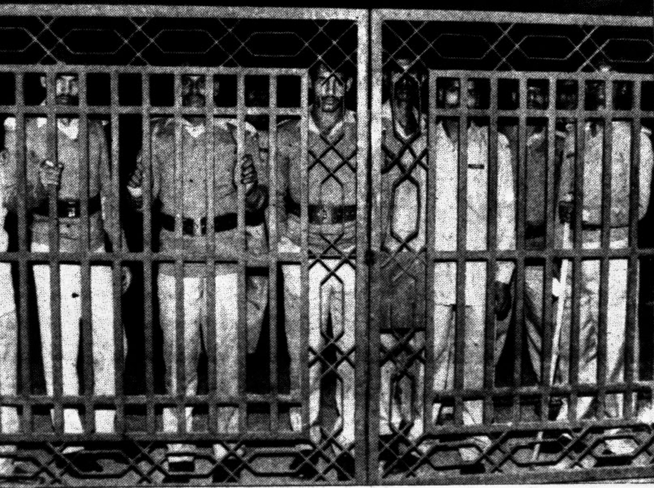
Revolting constables guarding the main gate of the Ansars Headquarter at Khilgaon in the city yesterday.