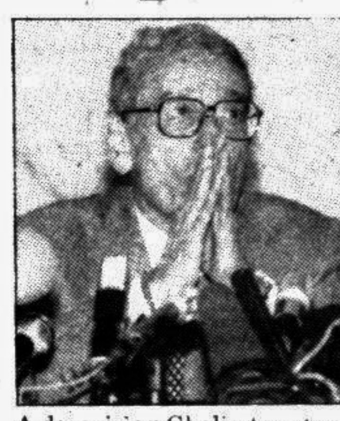
A despondent Ghali at yesterday's press conference in Sarajevo. up air strikes on the Serbs and end the ban on arms supplies to the Muslim-led government in Bosnia. In an effort to heal the divisions, US Secretary of State Warren Christopher swung behind the European view that See Page 8 Col 5

SARAJEVO, Dec 1: The United Nations has been forced to close Sarajevo's airport for UN Secretary-General Boutros Boutros-Ghali's visit to the capital on Wednesday, he said. AP adds: NATO foreign ministers on Thursday agreed to try to restart negotiations to end the war in Bosnia. They also approved a proposal to study how to expand the alliance to include former Warsaw Pact foes. The plan to open up to the East was to be the centerpiece of the two-day meeting. But unprecedented strains between the United States and its European allies over the crisis in Bosnia overshadowed the talks. After a turnaround in US policy, NATO ministers also agreed to relaunch diplomatic efforts to end the Bosnian war — steering away from Washington's previous calls to step