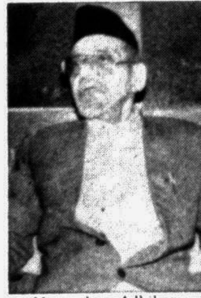
Manmohan Adhikari to some extent difficult and embarrassing. It has again to negotiate