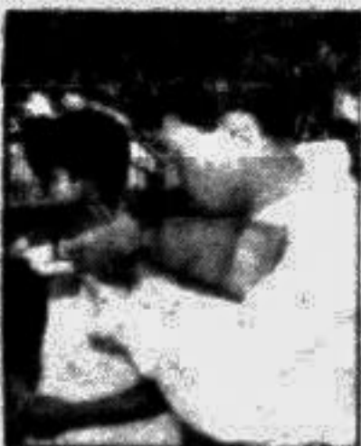
Balloon is a Target Page 3