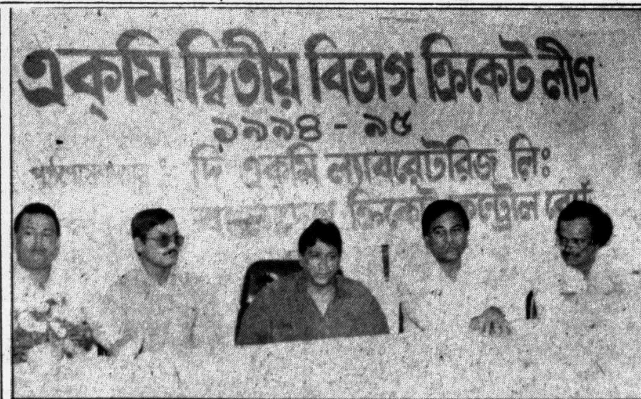
Speakers at a press briefing convened at the BCCB conference room on the eve of the Acme Second Division cricket league which begins today at different city venues.

He had earlier offered to return but on condition that he was appointed captain of the Australia 'A' side. However, selectors instead turned to fringe Test batsman Damien Martyn to lead the side against England, Zimbabwe and Mark Taylor's first