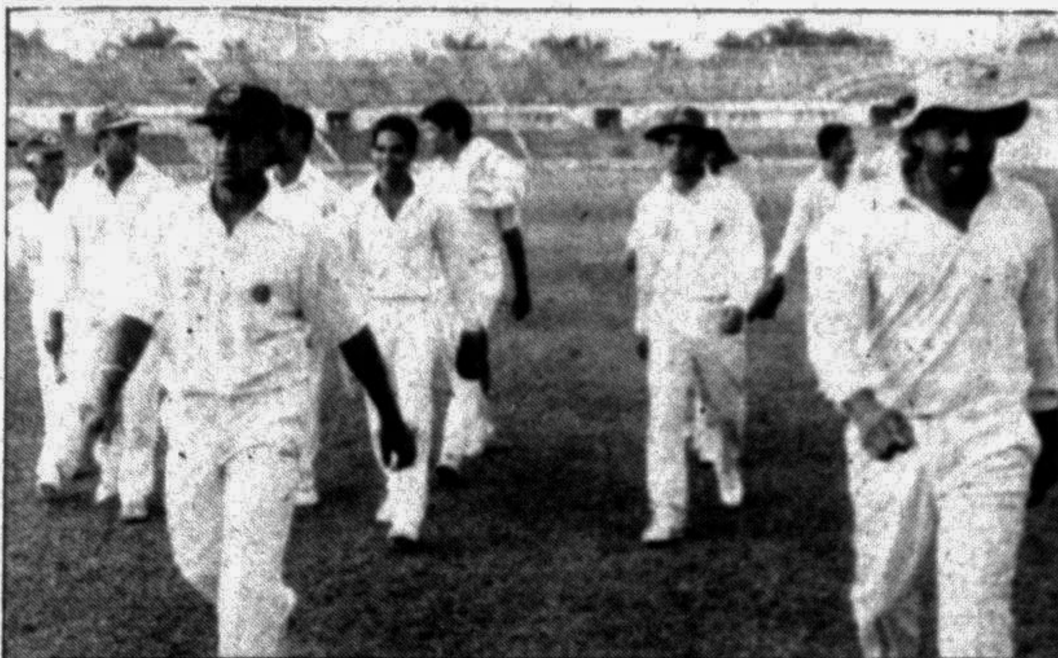
Victorious Bangladesh Biman cricketers walk back to the dressing room after winning their 15th Damal Summer second round opener against Brothers Union by 17 runs at the Dhaka Stadium yesterday.

Schmeichel, 31, has torn muscles around his spinal discs and will not play until he is fully recovered, team officials said.