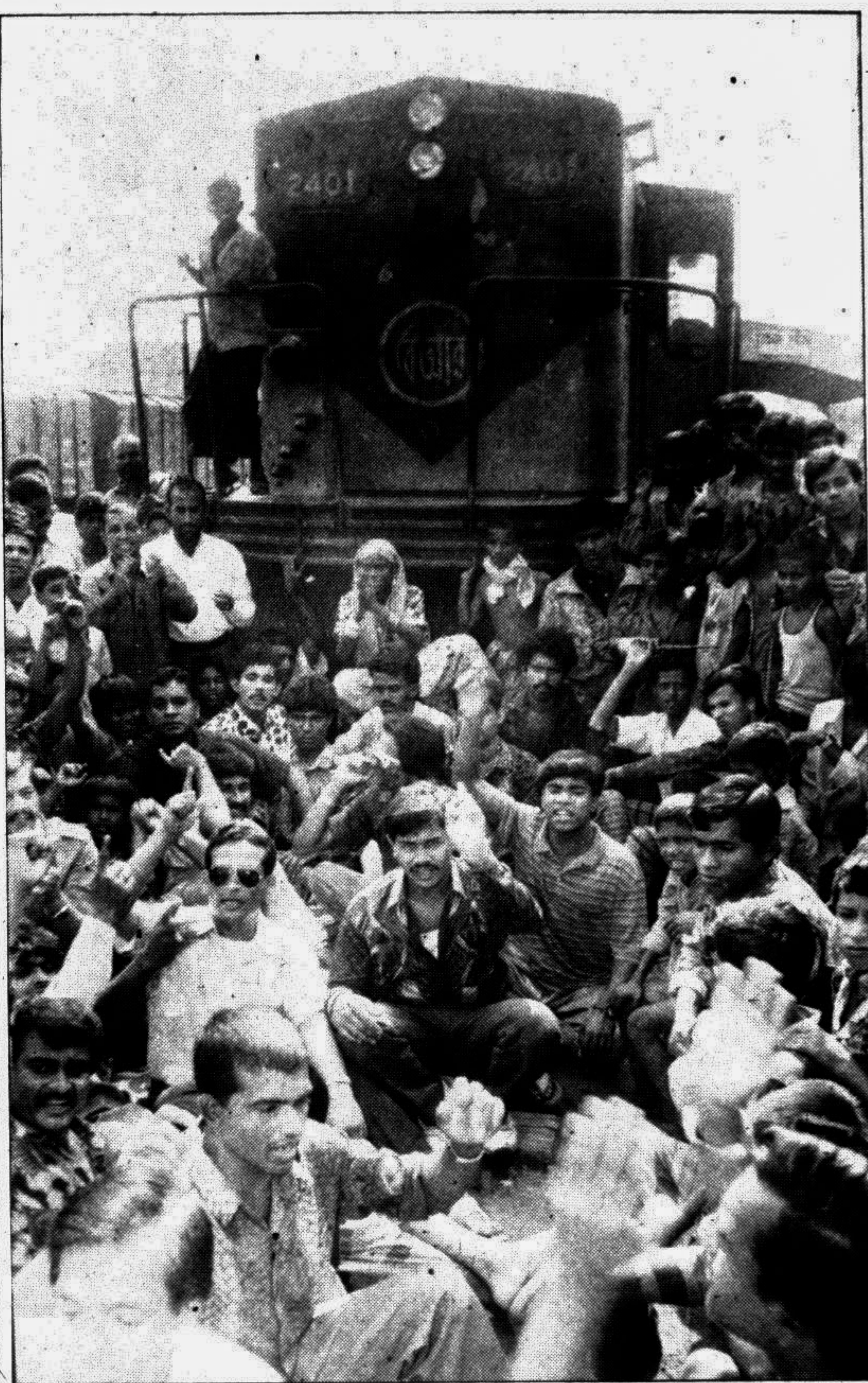
Pickets near Pubail railway station during the Opposition's rail and road programme yesterday.

It is claimed that BDR and Police, sent several lists of their seizures to Narcotics Department in 1989 and specimen of heroin was sent with request for chemical tests. It is hard to believe how records of seizures are not kept with the local Narcotics Department.