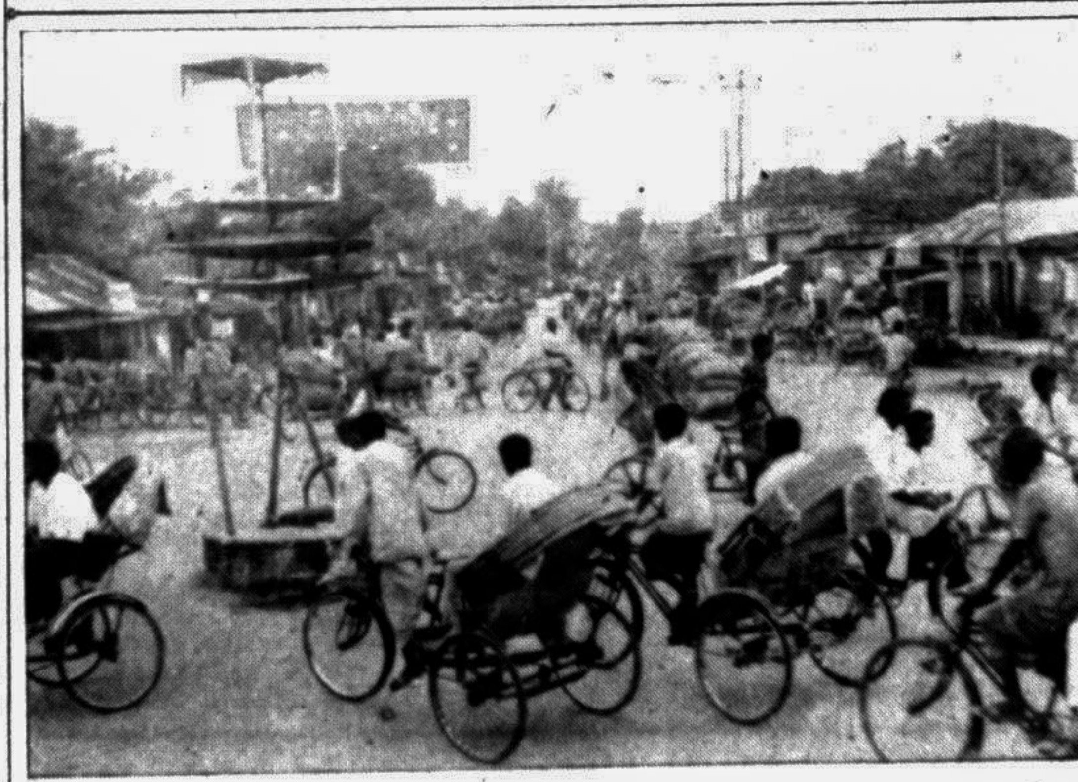
NO TRAFFIC POLICE: Traffic movement is often disrupted in absence of a traffic police. The photo shows the traffic police absent from duty at the Shapla Chattar in Rangpur town.

At present there is no stock of vaccines in the district council. It is also not available in the local markets.