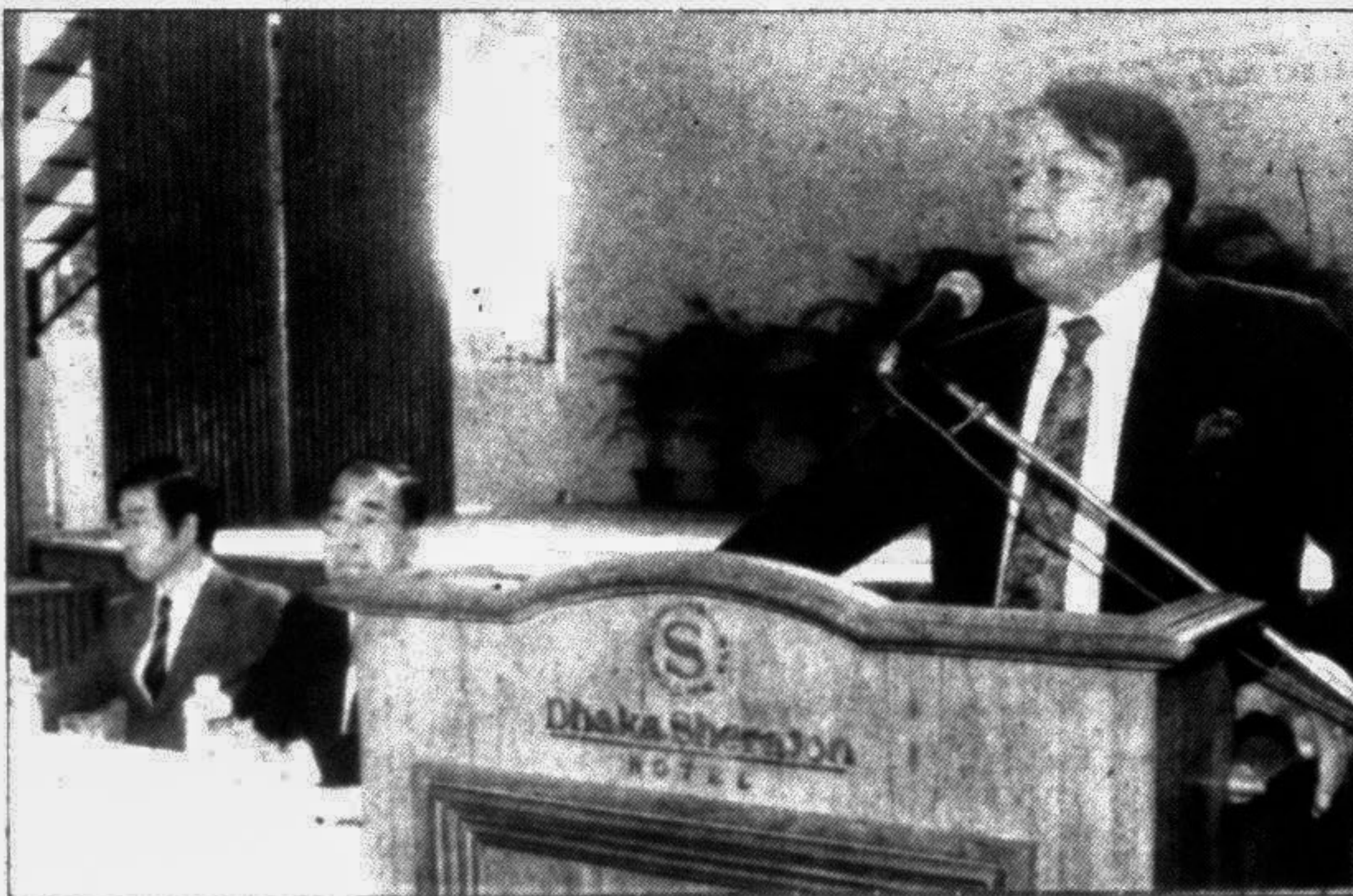
Special envoy of the Prime Minister M Morshed Khan addressing as chief guest at a seminar on 'Two Decades of Japan-Bangladesh Cooperation' at a local hotel in the city yesterday.