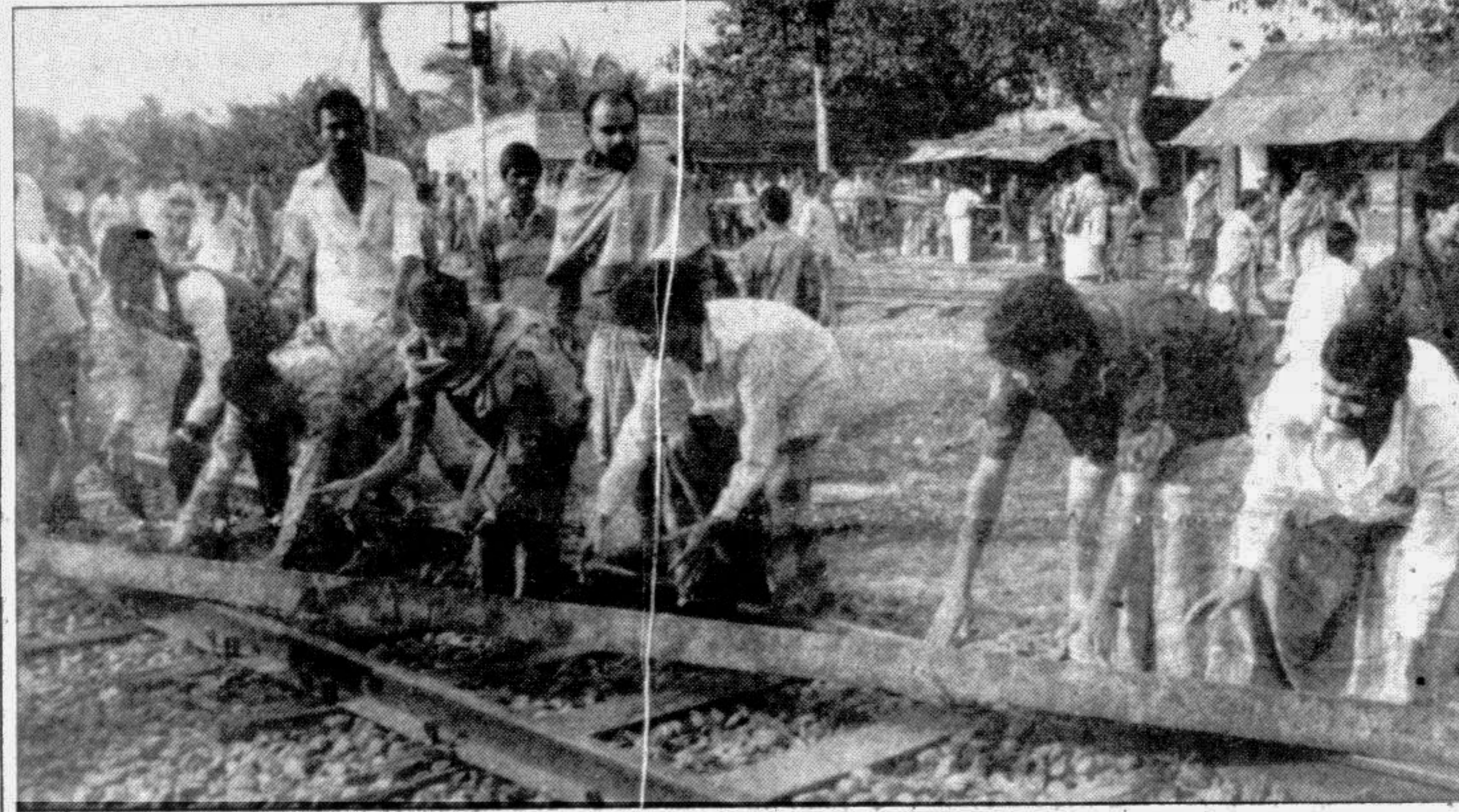
Opposition supporters yesterday placed rails across the tracks at the Tongi railway station as part of their road-rail barricade programme.