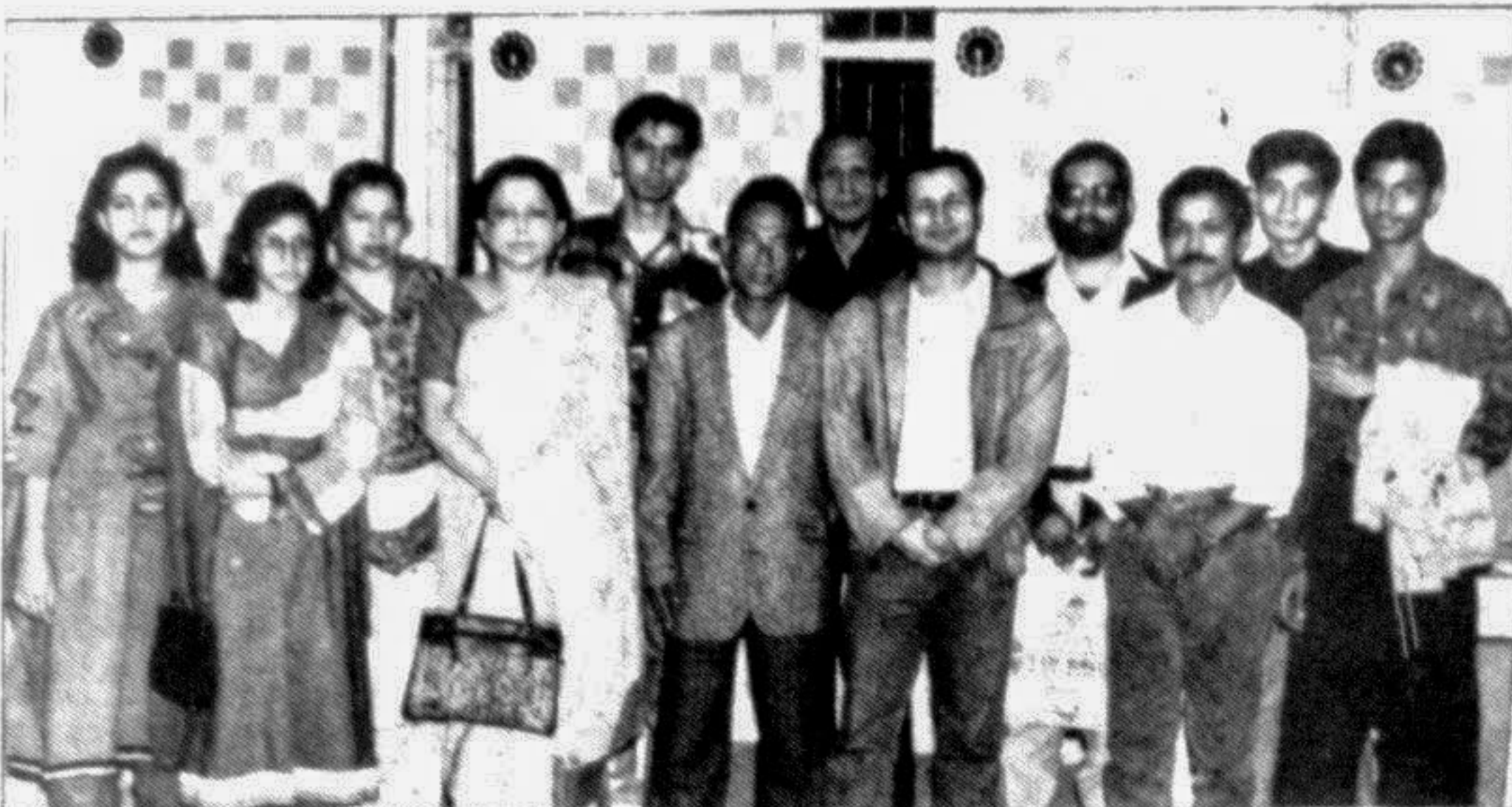
The eleven-member Bangladesh team which left Dhaka yesterday to take part in the 31st Chess Olympiad, beginning in the Russian capital, Moscow from November 30.