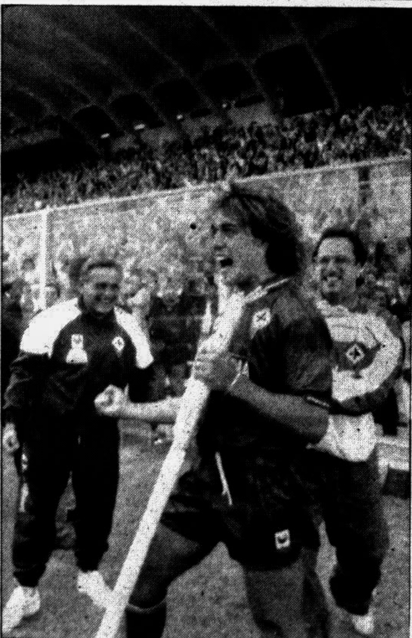
A recent picture of Fiorentina's Argentine striker Gabriel Batistuta. Batistuta broke a 32-year Italian scoring record netting his thirteenth goal in eleven matches against Lazio in a league match on Nov 27. He has scored in every game of the season beating a ten-match record established by Ezio Pascutti in 1963 for Bologna.