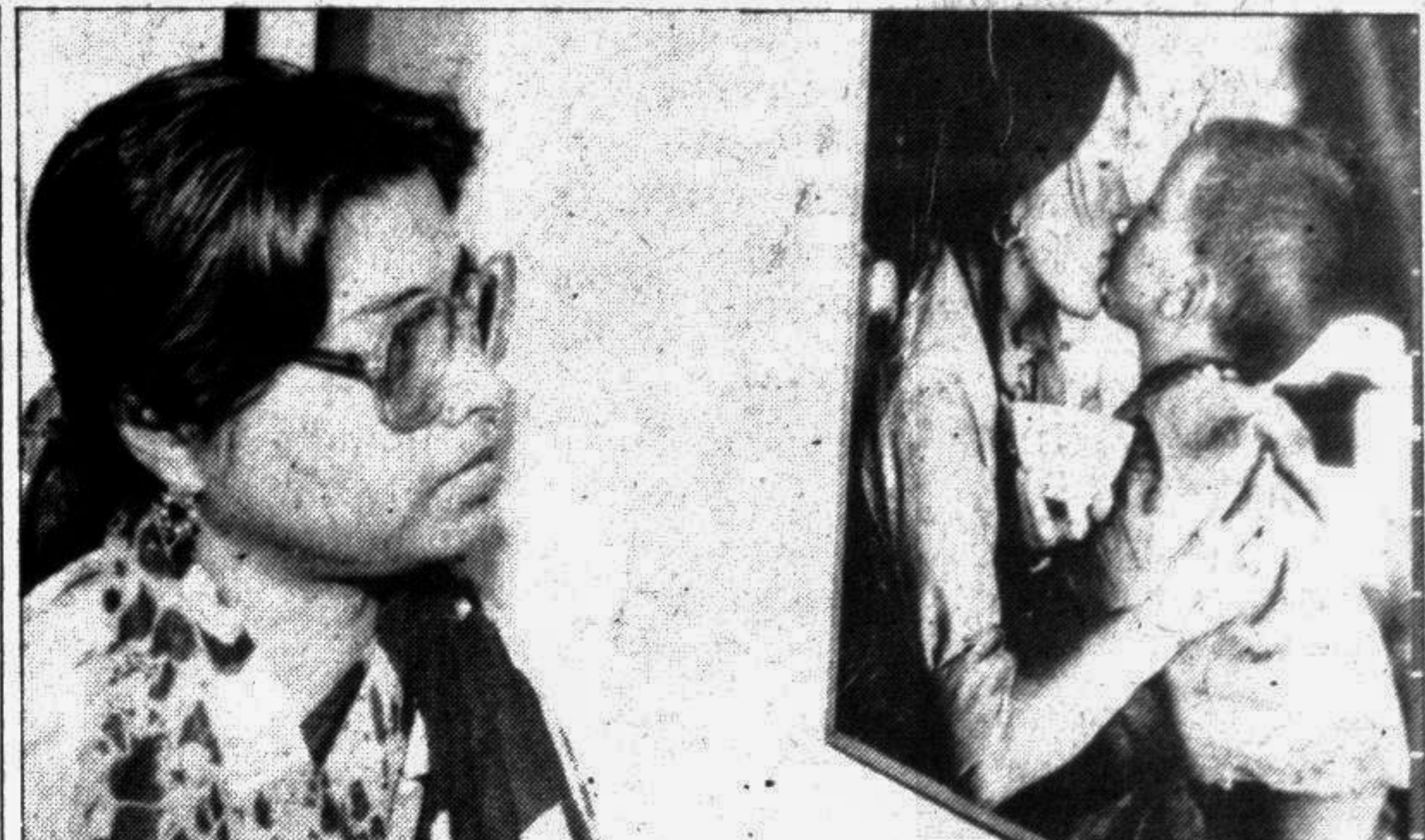
A visitor at a photo exhibition of the awarded photographs in 17th photo contest of the Asian Cultural Centre for UNESCO at city's Shilpakala Academy auditorium yesterday. The show will remain open for all from 2 pm to 7 pm till tomorrow.

The date of the elections was fixed in a meeting of the DUTA working committee yesterday, said a press release of the association.