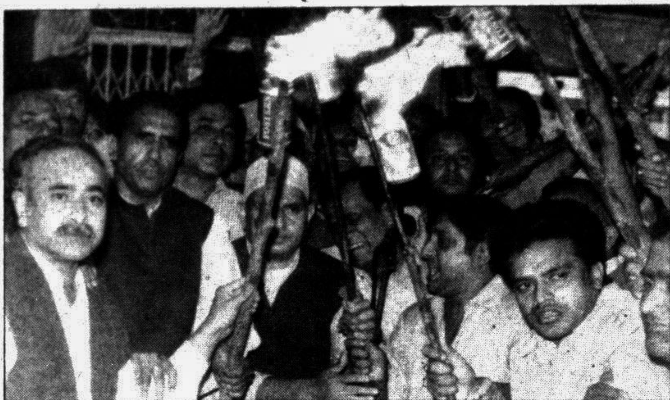
Awami League brought out a torch procession in the city yesterday to drum up support for today's rail and road blockade programme of the major opposition parties.