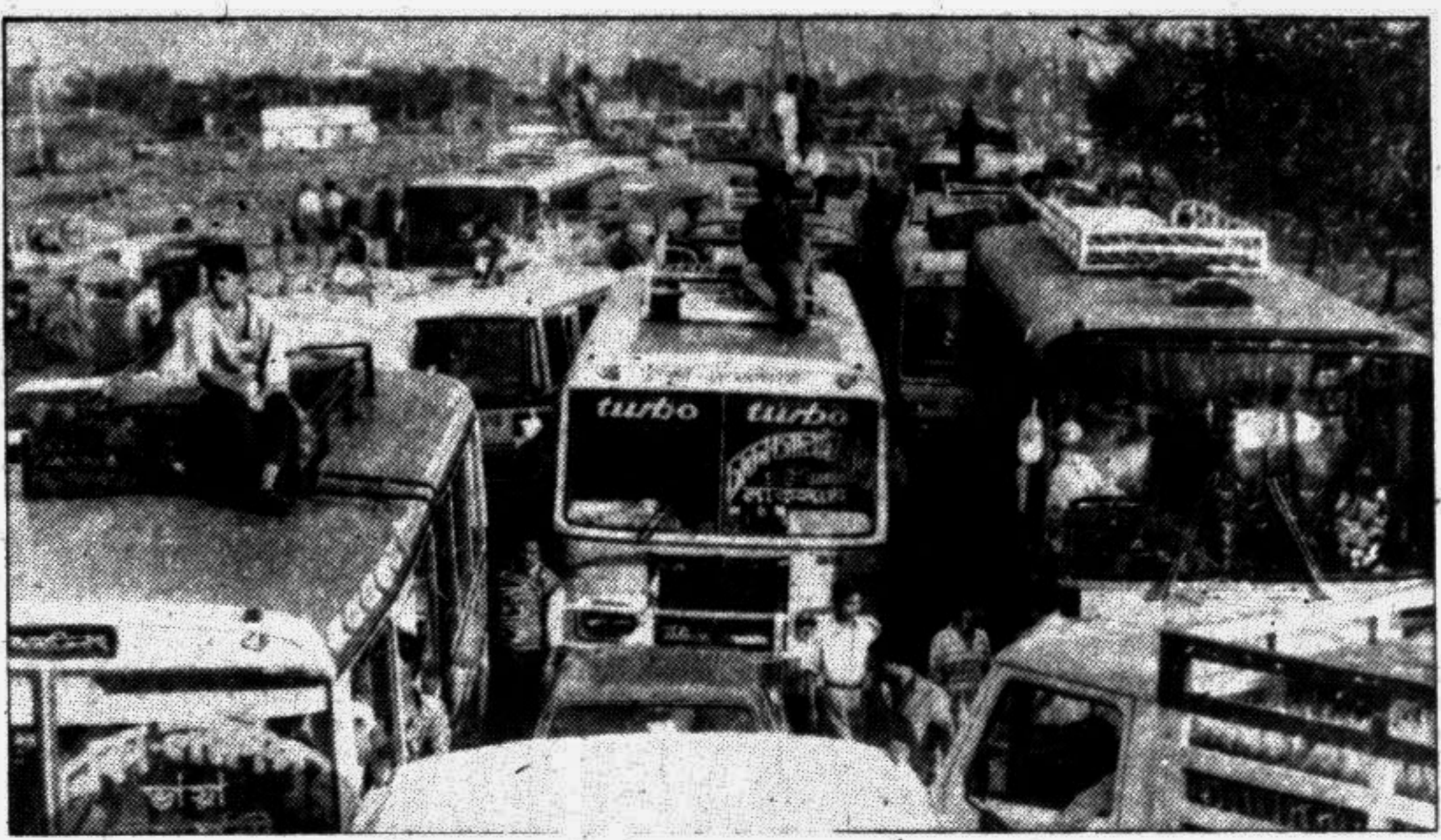
A large number of transports got stuck in an acute traffic jam on the Dhaka-Narayanganj and Dhaka-Chittagong roads yesterday during the Opposition padajatra.

Bihac will not be allowed to fall," aid worker Montique Tuffelli said. But with gun and shellfire echoing 900 metres from the town's overcrowded hospital, she added: "They know there is no way they can escape their fate." Bosnian and Croatian Serbs have captured a third of the Bihac town safe area in north-west Bosnia during a five day offensive in pursuit of the 5th corps, which they have vowed to destroy. US Defence Secretary William Perry admitted on NBC television that the Serbs were strong enough to overwhelm the town whenever they wanted. As Bihac's mayor pleaded in a radio broadcast for the UN to strike with NATO warplanes, Perry added: "Even if (peacekeepers) ask for airstrikes, airstrikes cannot determine the outcome of the ground combat." The 5th corps is estimated to have no more than 400 men left in Bihac facing some of the Bosnian Serb Army's (BSA) toughest fighting units, equipped with tanks and artillery. UN commander Lieutenant-See Page 12 Col 2