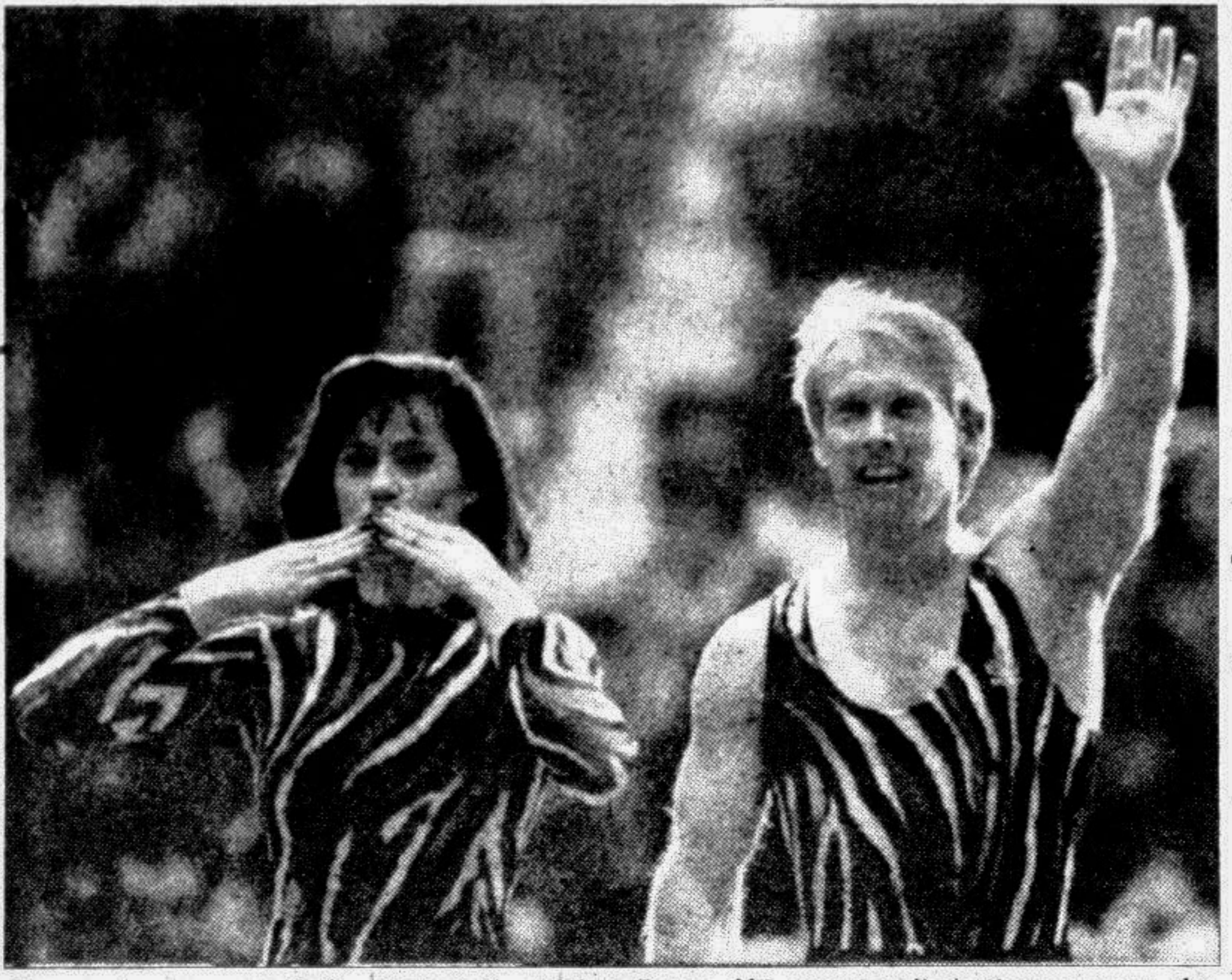
Romanian gymnast Nadia Comaneci and her fiance, US gymnast Bart Conner greet the audience after performing a programme at Bucharest's largest arena on Nov 25 on the fifth anniversary of her defection to the west.