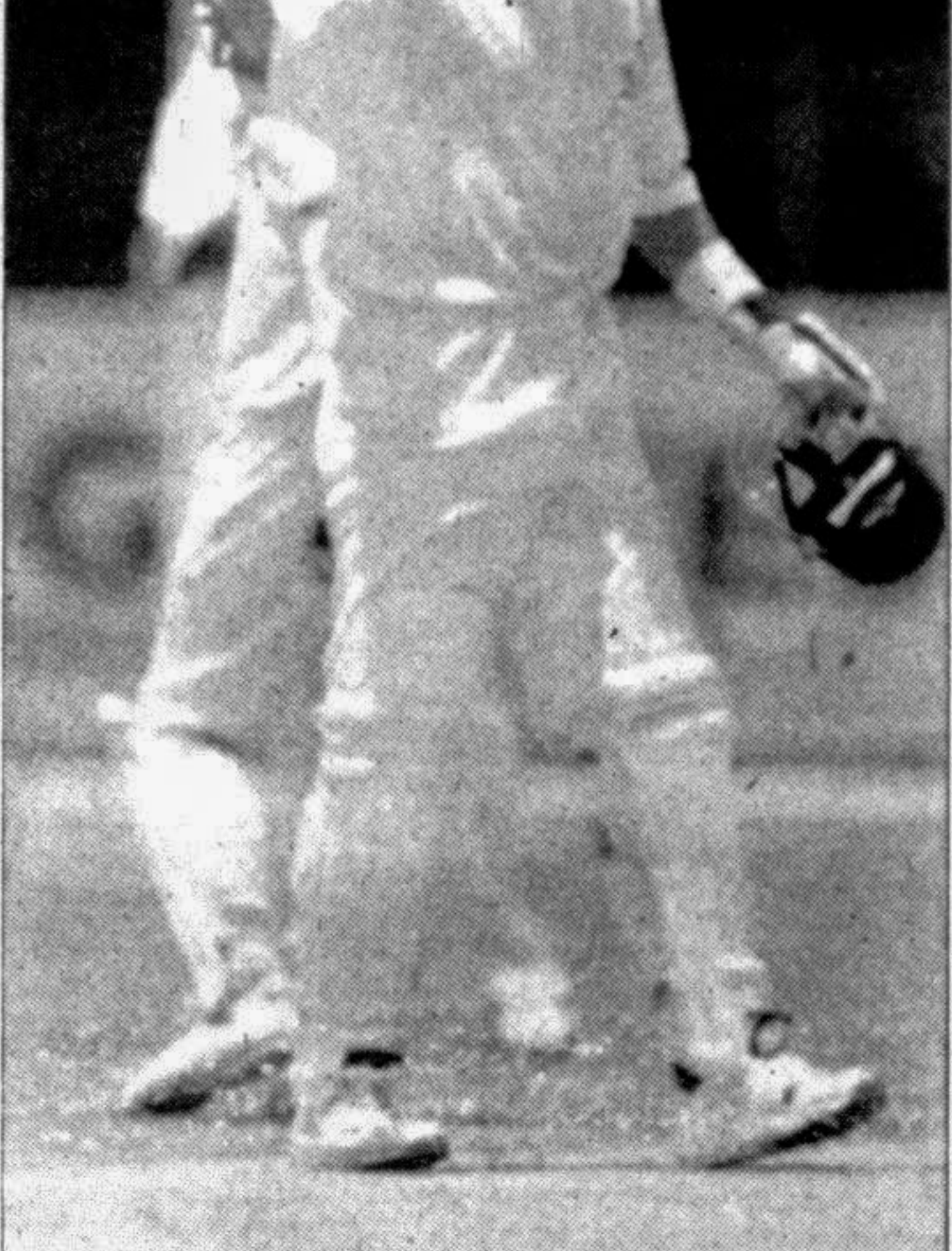
Australian Mark Waugh acknowledges the crowd's applause after reaching his seventh Test century during the second day of the first Ashes Test against England at Gabba, Brisbane yesterday.

Scoreboard on the second day of the first Test between Australia and England at the Gabba today.