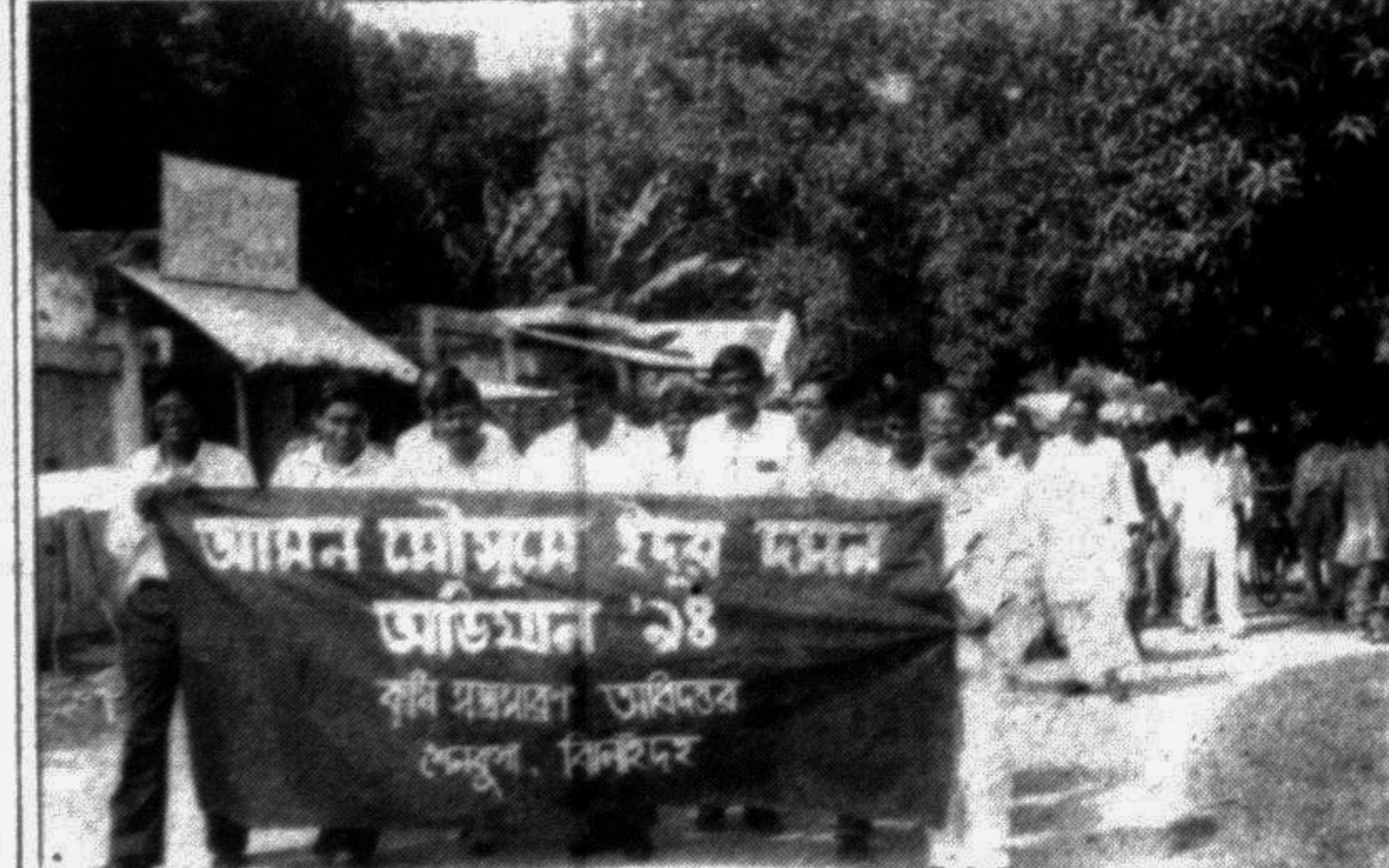
JHENIDAH The district Agriculture Extension Department recently brought out a procession on the occasion of rat eradication during aman seasons.