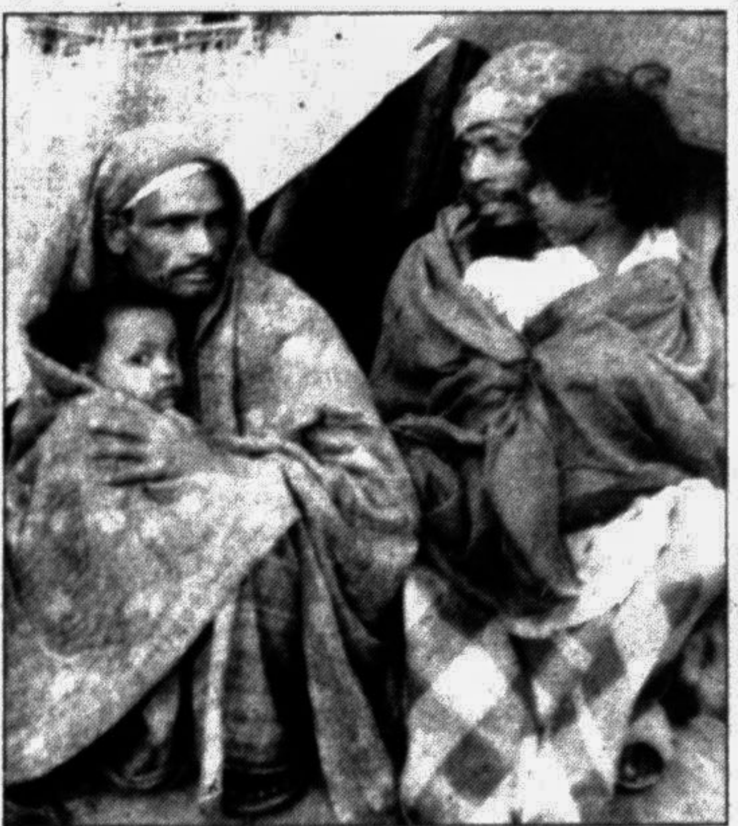
A light drizzle over the city forced these slum dwellers and their children to seek warmth of quilt and shawl for most of the day.

From Page 1 Col 5 vate sectors of the two countries would take effective steps towards further expanding and diversifying cooperation in the fields of trade, industry and manpower. He said two sides had extensive discussions to further strengthen the SAARC and added that the Bangladesh Prime Minister, current Chairperson of the seven-nation regional forum, had talks with President Gayoom on the need for developing close ties between the SAARC and other regional bodies including the ASEAN and the European Union. The two leaders discussed many other issues of common concern including the global trouble spots, Rahman said.