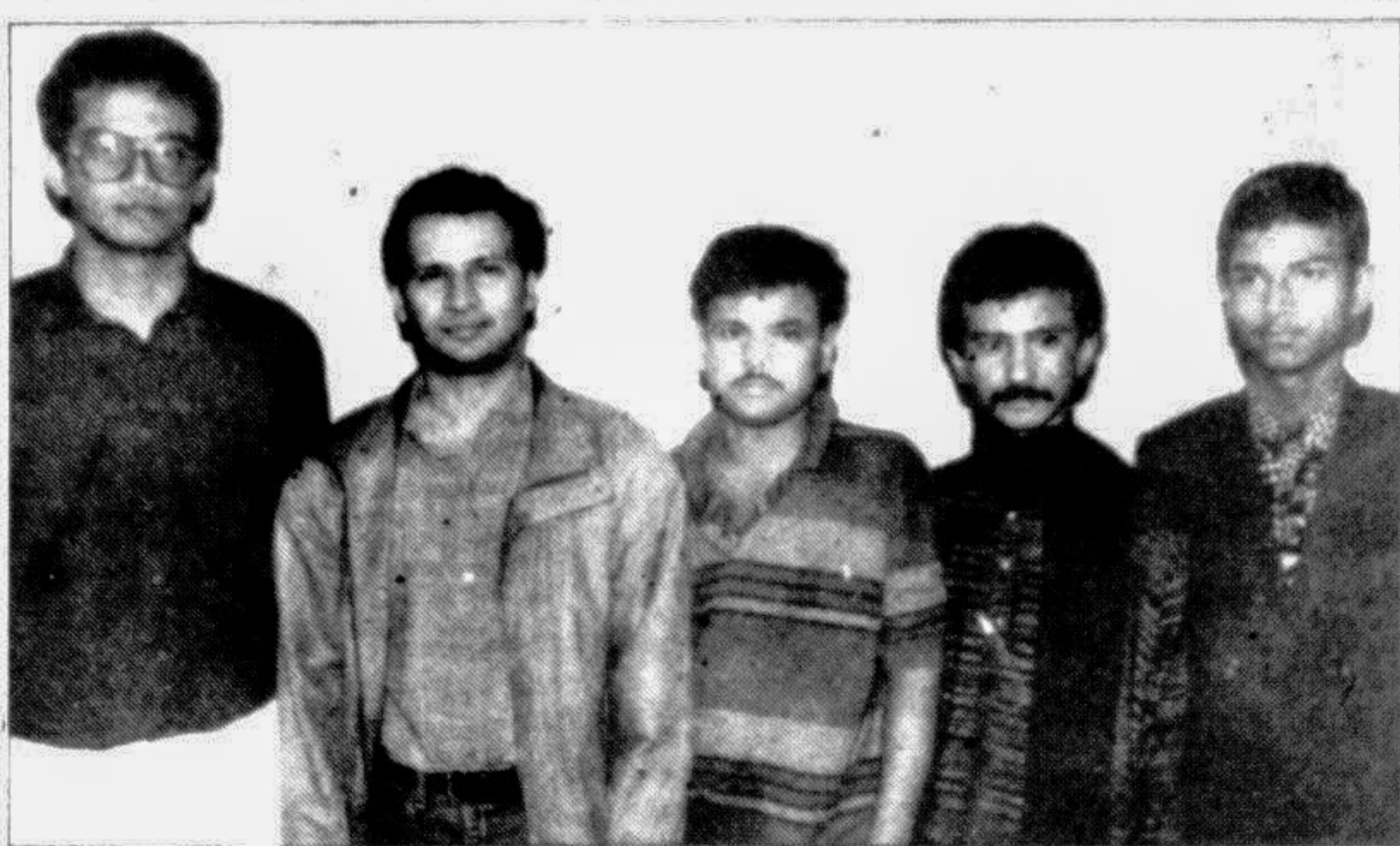
Members of the Brothers Union team which retained the First Division chess league title yesterday with a round to go in the 17-team fray.