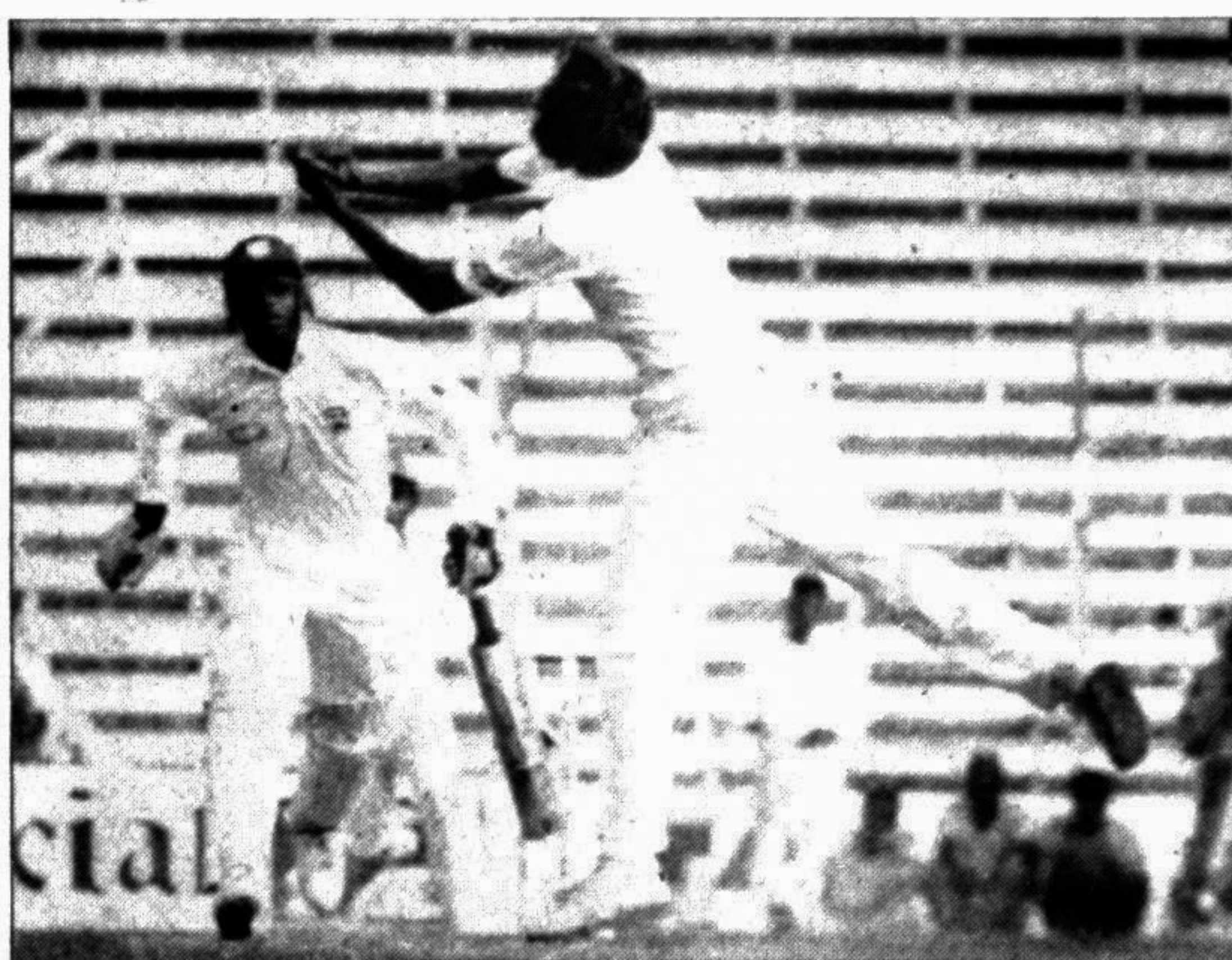
Indian strike bowler and man-of-the-match Javagal Srinath (C) holds onto a catch to dismiss West Indies skipper Courtney Walsh on the final day of the first cricket Test at the Wankhede Stadium in Bombay on Nov. 22. India won by 96 runs to go one-up in the three-match series.