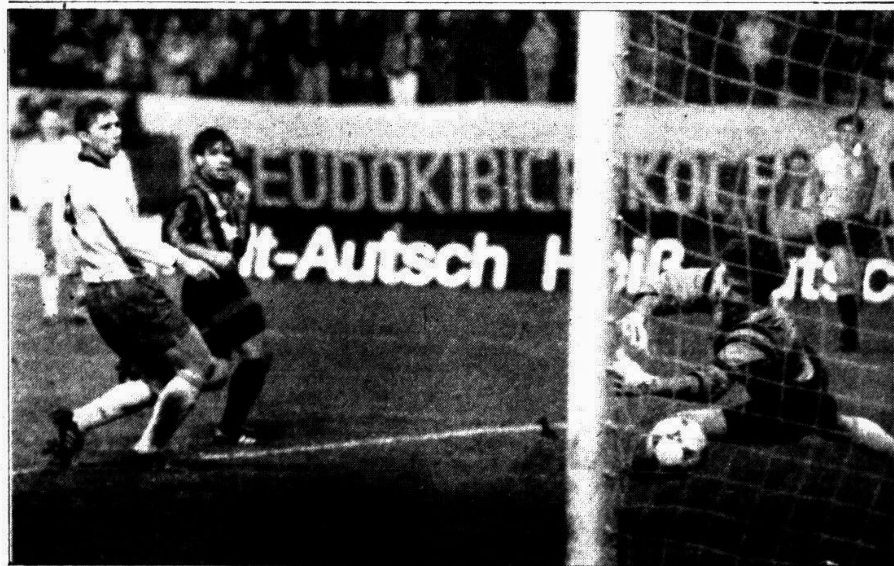
Ulf Kirsten (C) of German club Bayer Leverkusen watches the ball beat the keeper to add his team's third goal during their UEFA Cup match against GKS Katowice in Poland on Nov 22. Leverkusen trounced the Polish outfit 4-1.

Unal Karaman pulled one back for the Turks who now have a huge job on their hands if they wish to repeat their giant-killing performance of round two when they knocked off former European champions Aston Villa of England.