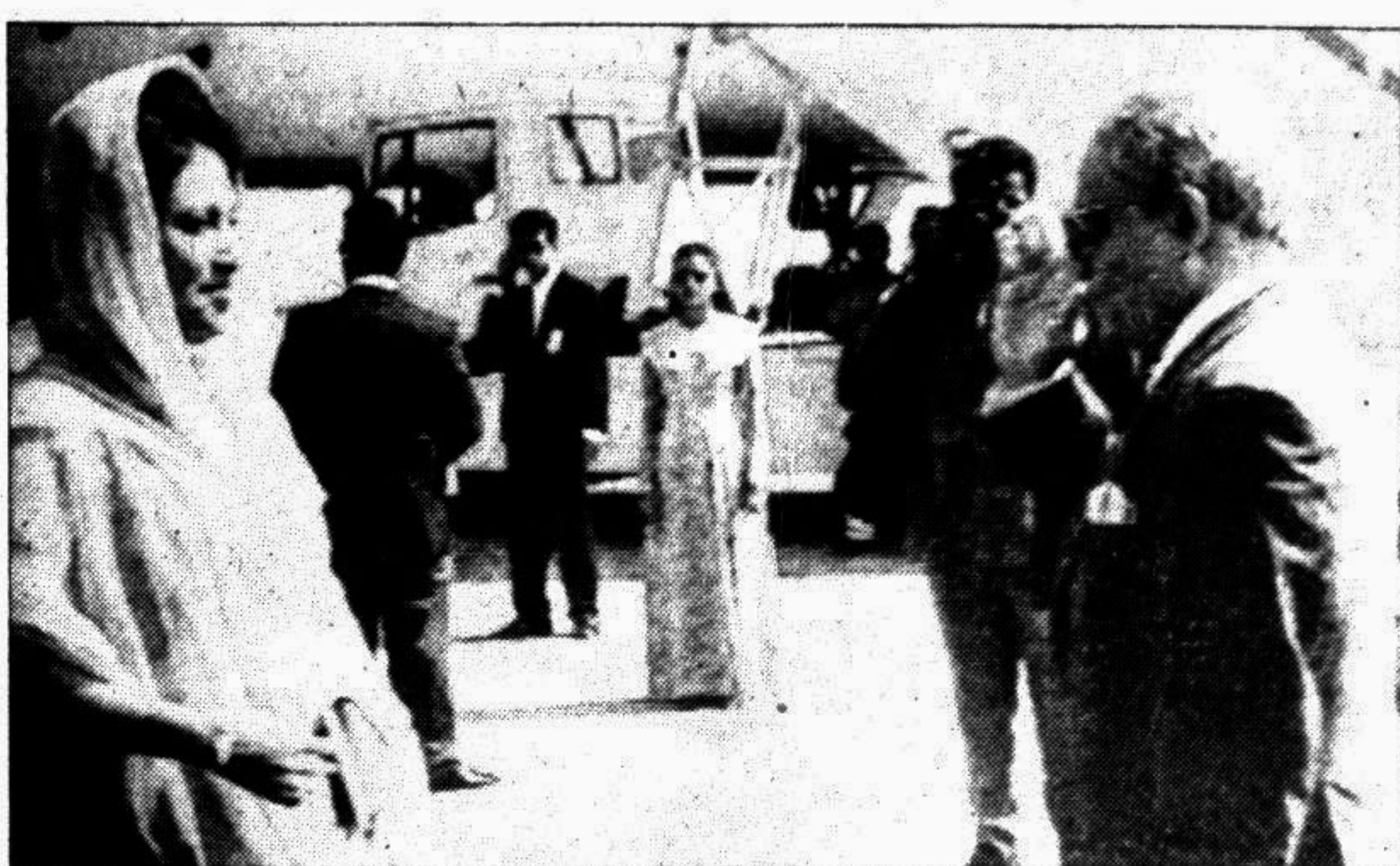
SAARC Chairperson and Bangladesh Prime Minister Begum Khaleda Zia being received by President of Maldives Maumoon Abdul Gayoom at the Male International Airport on her arrival on a two-day visit yesterday.

BONN, Nov 23: The Mayor of Bihać said by satellite telephone today, that Serb forces were inside the besieged town and only 500 metres from the centre, reports Reuters. Hamdiya Kabljagic told journalists that Serb troops had seized control of several districts in Bihać town. A Zagreb report says, Serb and Muslim forces are fighting a fierce battle inside the perimeter of the Bihać town 'safe area,' a United Nations spokesman said. There is extremely heavy fighting going on south of the town on a hill feature called Debeljaca, which is the last point of defence for the (Bosnian army) 5th corps before the town. It is going on inside the safe area, Alexander Ivanko told Reuters. Ivanko said the UN was very concerned for the security of its 1,200-man Bangladeshi peacekeeping battalion in the Bihać pocket as well as 15 UN civilians who had been brought under the protection of the peacekeepers in Bihać town. UN officials feared today that Serb troops might overrun the Bihać pocket in north-western Bosnia, creating a 'nightmare scenario' of thousands of refugees crammed into a tiny area without food, water or shelter. "The Bihać 'safe area' is fairly small, but the population of the entire pocket is fairly large - about 180,000 people", said Kris Janowski, a spokesman for the UN High Commissioner for Refugees (UNHCR). NATO warplanes today bombed Serb positions in two air raids, striking at Serb surface-to-air missile sites that had fired on British jets over See Page 12 Col 1