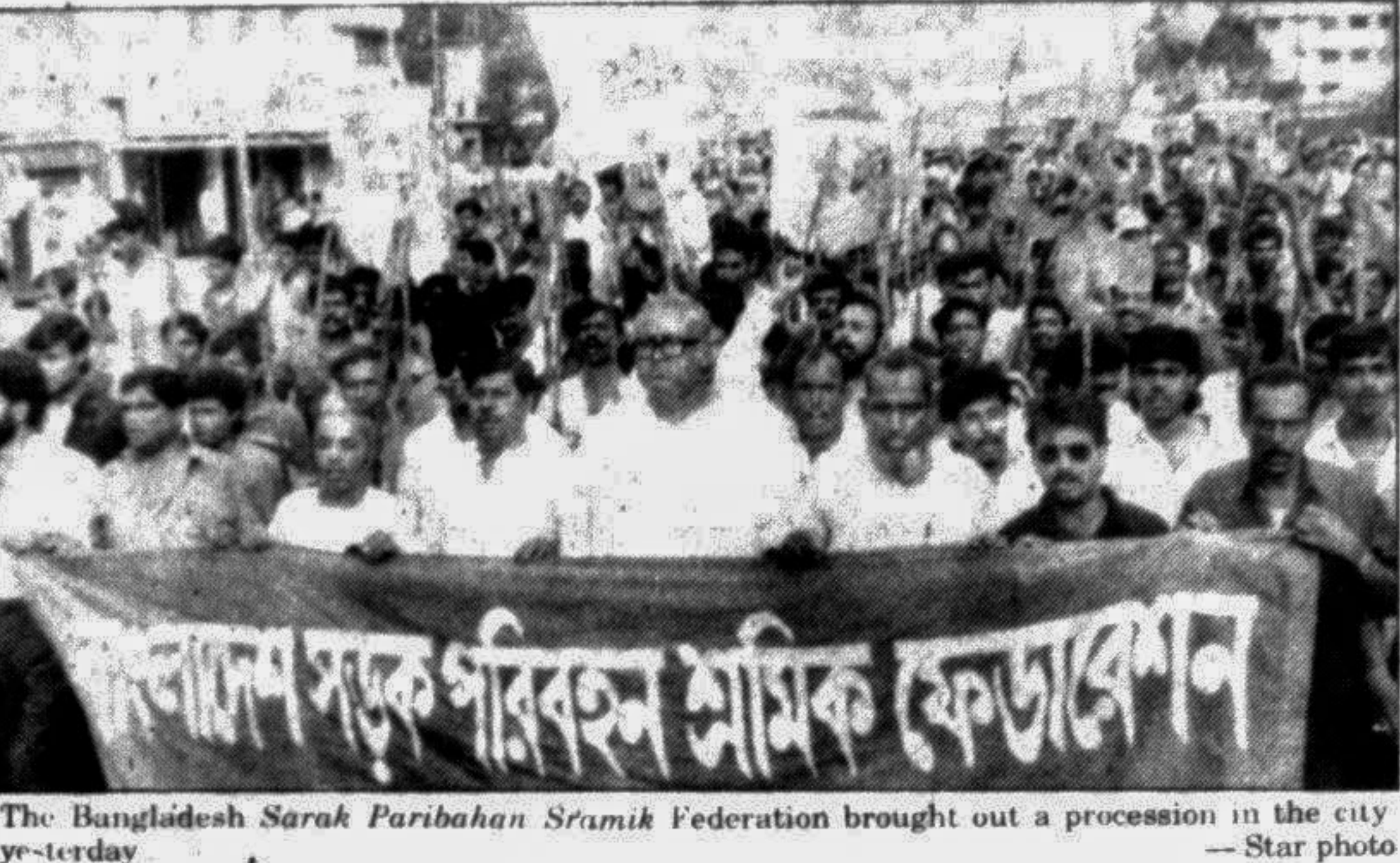
The Bangladesh Sarak Paribahan Samik Federation brought out a procession in the city yesterday.

Tender Notice Quotations are invited to supply machineries for a salt iodizing factory. Please collect/submit schedule on or before 15.12.94, 12:00 Noon. Shantahar Ali Fresh Salt Industries Kakul-Gataish, Tongi.