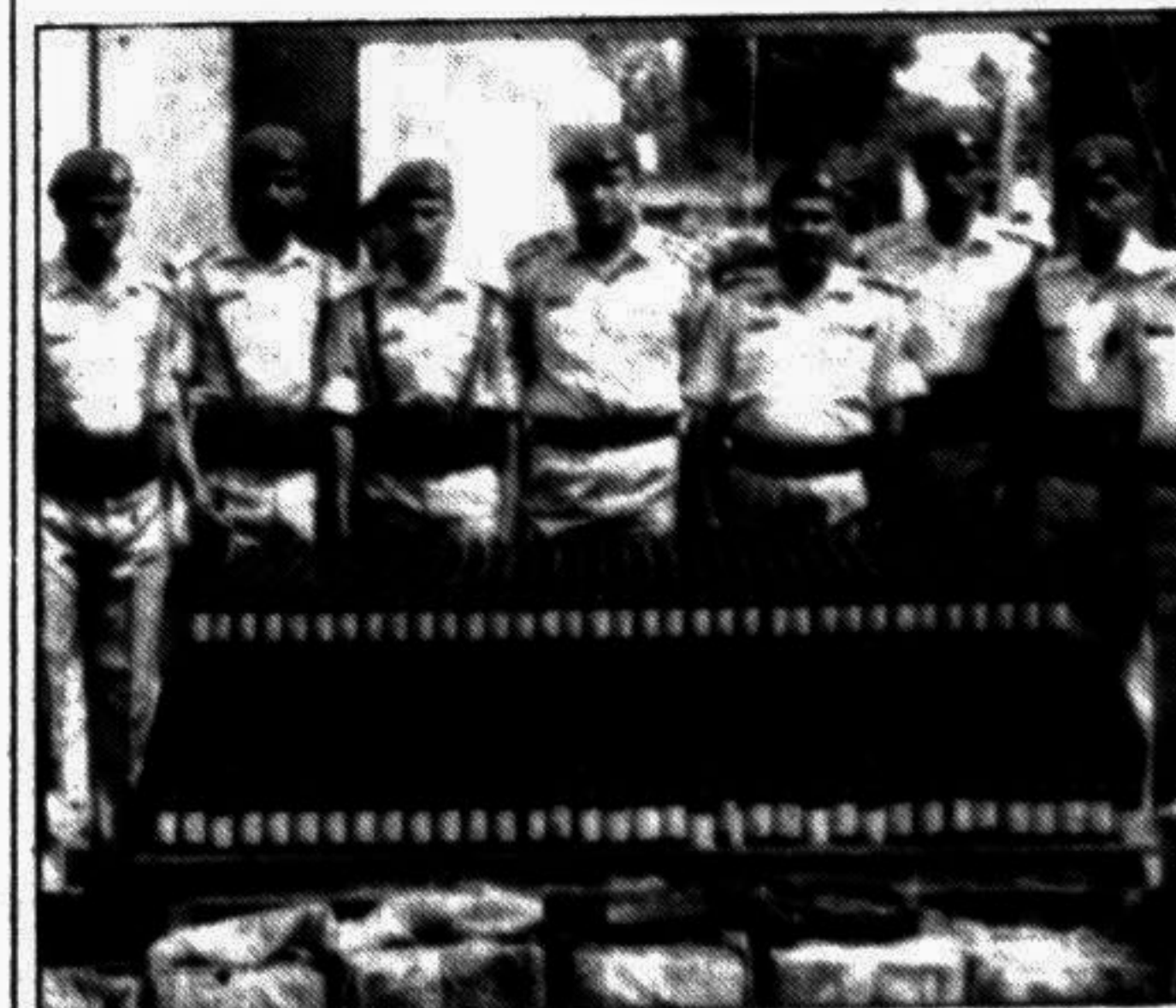
BRAHMANBARIA: The BDR men recently seized Indian made phensidyle syrup bottles worth Tk two lakh from Debagram of Akwra thana of the district.

They said, Indian goods amounting to Taka two to three lakh on an average are being seized every day. However, local people claimed that smuggled goods worth crores of taka are pouring in the district daily.