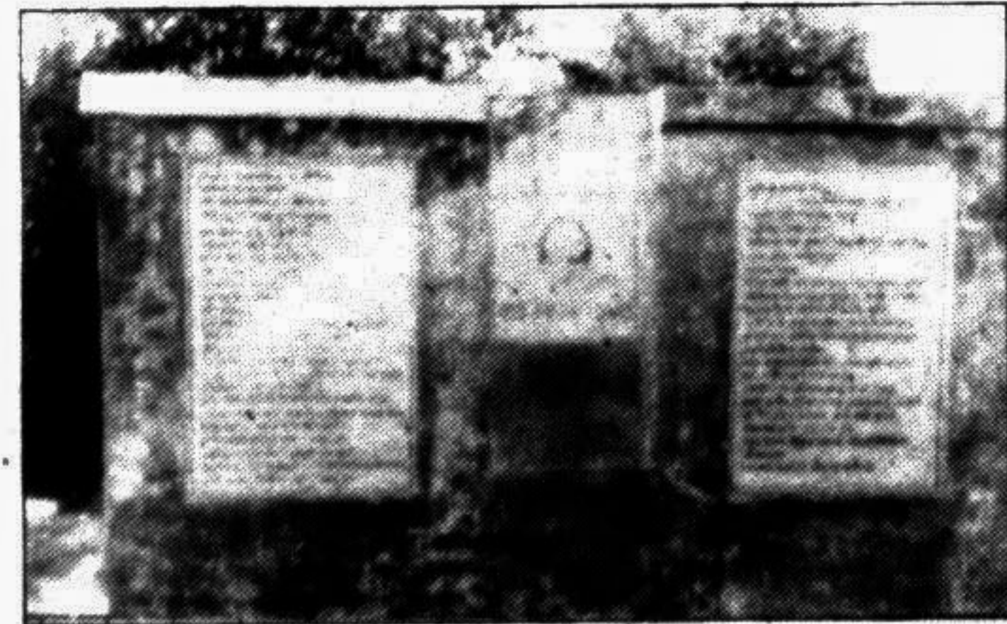
Writings on a wall tell facts about the battle ground at Muktingar.

The battlefield was full of dead bodies and none came to remove them. The allied forces advanced under coverage of 25mm gun, destroyed the enemy front in the battle, they described. In fact, the disastrous consequence suffered by