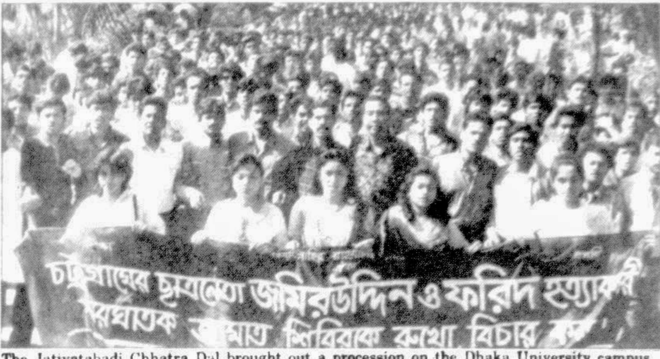
The Jatiyatabadi Chhatra Dal brought out a procession on the Dhaka University campus yesterday protesting the killing of two of its activists in Chittagong Sunday morning.