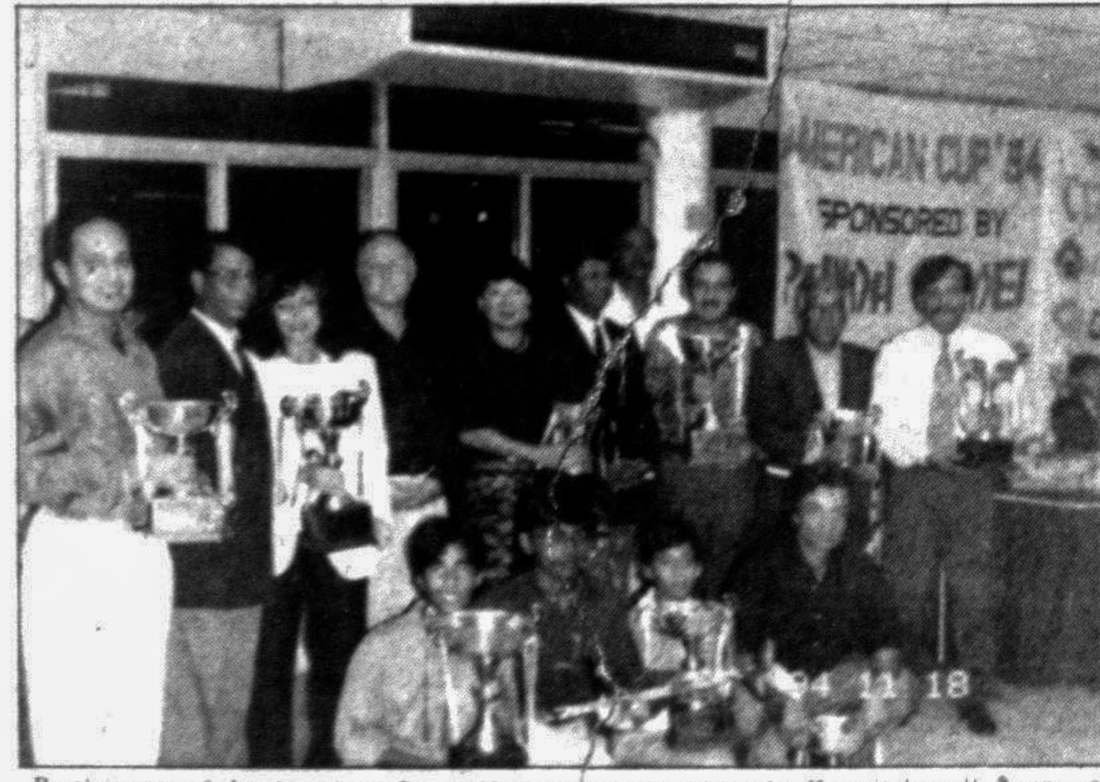
Participants of the American Cup golf tournament held at the Kurmitola golf course on Friday.