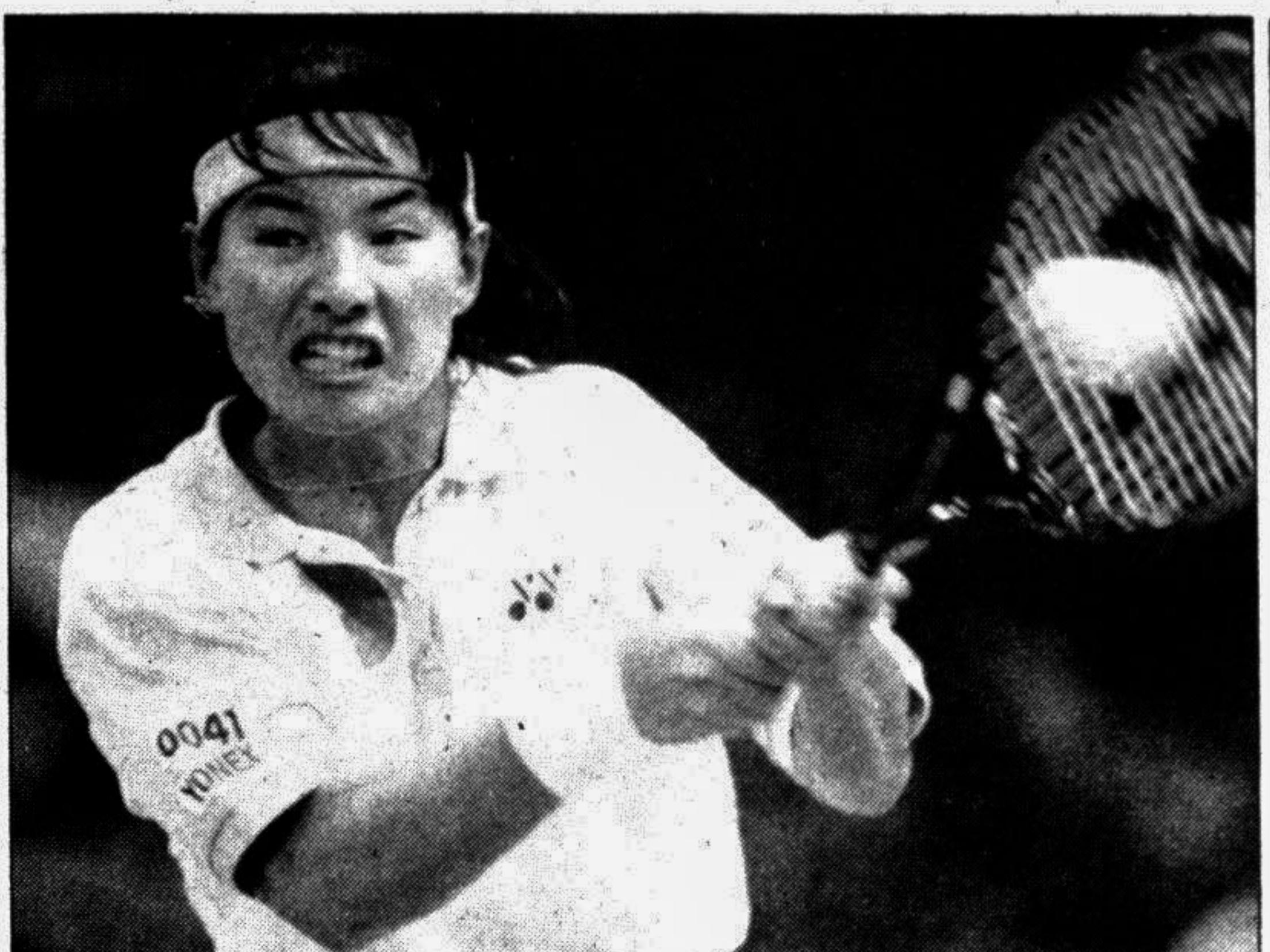
Kimiko Date of Japan plays a backhand return to Conchita Martinez of Spain in the quarterfinals of the Virginia Slims Championships at Madison Square Garden in New York on Nov 18. Date won 2-6, 6-4, 7-6.