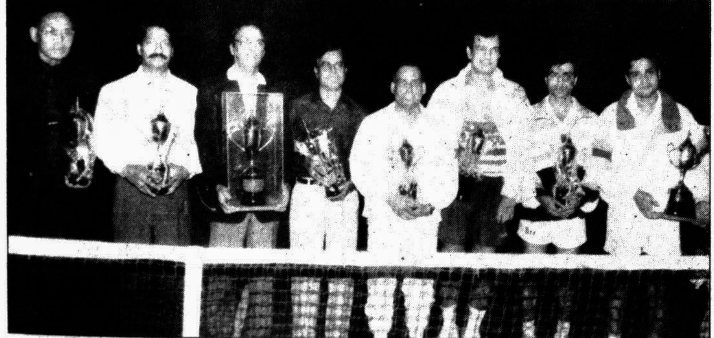
The winners of the seventh Nasiruddin memorial tennis tournament that concluded at the Officers' Club courts yesterday.