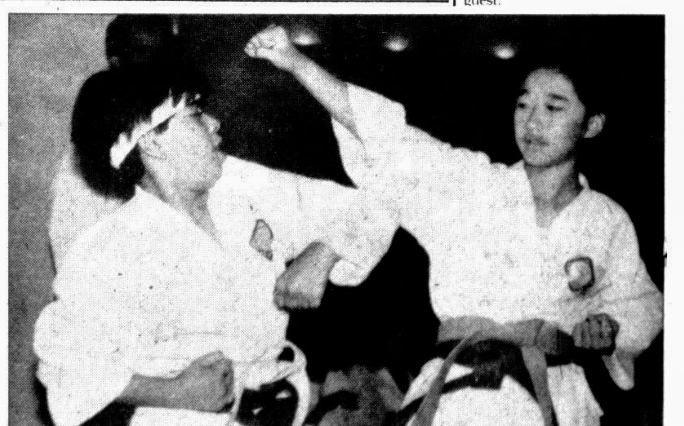
Action from the first-ever Shotokan Karate Cup '94 at the ballroom of the Hotel Purbani yesterday. The competition was organised by the Bengal School of Shotokan.