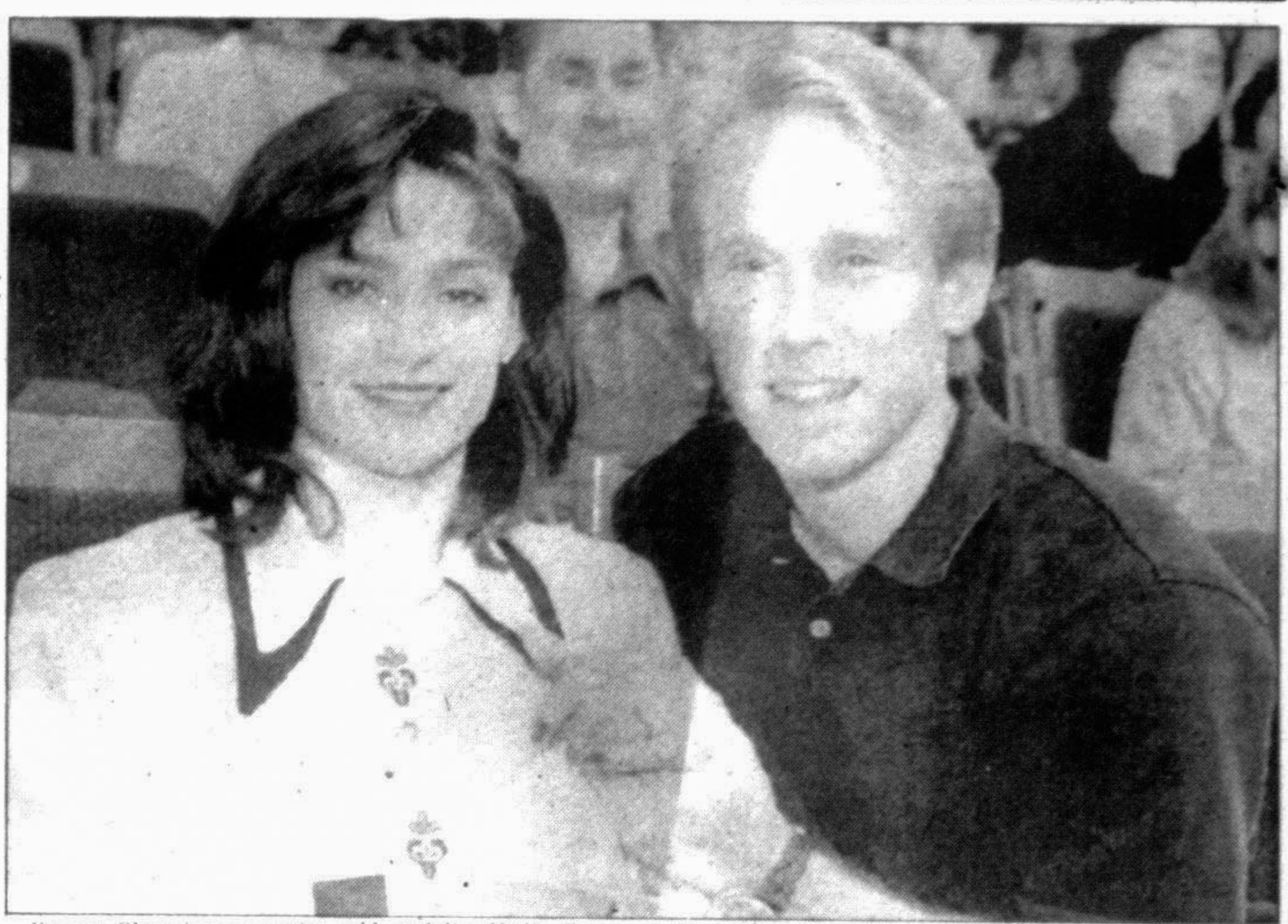
Former Olympic gymnastics gold medalist Nadia Comaneci (L) of Romania and her American fiance Bart Connor pose together with the diamond engagement ring in Dortmund on Nov 17. The couple have yet to fix a wedding date.