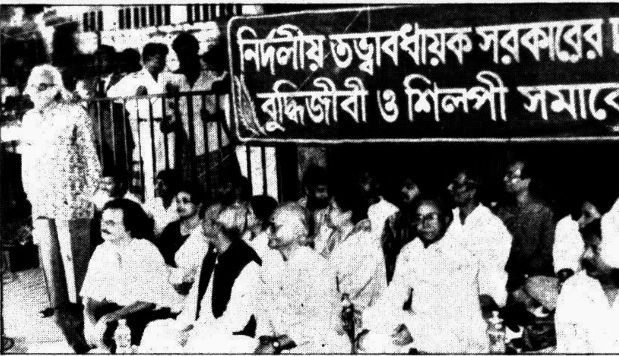
Poet Shamsur Rahman addressing a rally of the intellectuals and artists demanding elections under a caretaker government in front of the Jatiya Press Club yesterday.