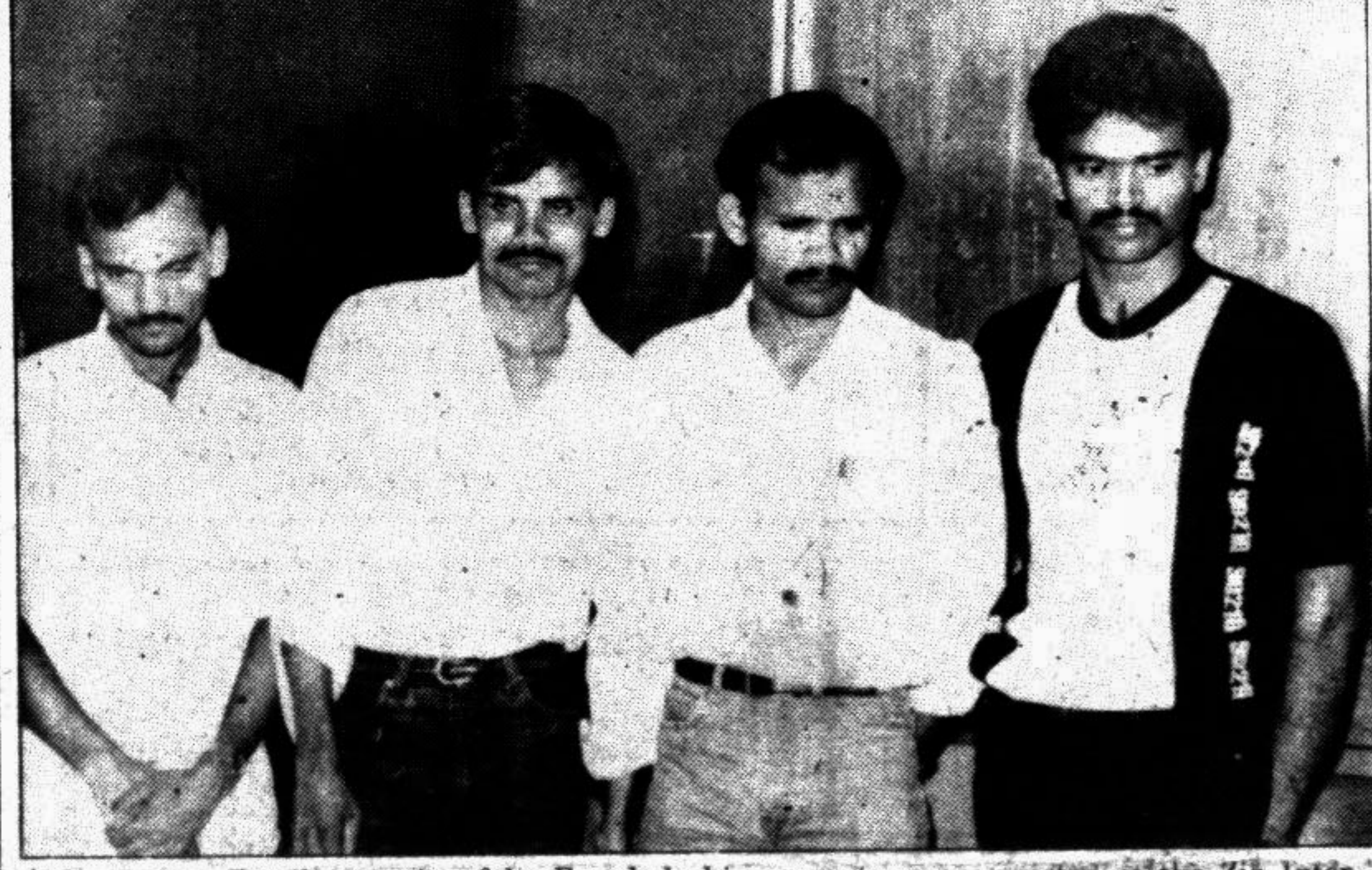
Four Indian Tamils carrying fake Bangladeshi passports were arrested at the Zia International Airport yesterday.