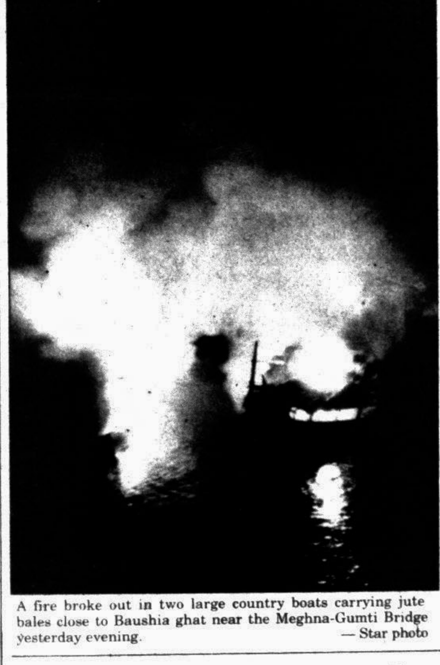
A fire broke out in two large country boats carrying jute bales close to Baushia ghat near the Meghna-Gumti Bridge yesterday evening.

KATHMANDU, Nov 18: A communist alliance consolidated its lead today, bagging 84 of the 169 seats for which results were declared, moving closer to becoming the single largest party in parliament and forming a coalition government in Nepal, reports AP. The governing Nepali Congress party was trailing with 61 seats and the pro-marchy National Democratic Party had bagged 16. The remaining seats were shared by independents and a smaller party. The communists appear to have appealed to the many poor people in Nepal by promising land reforms that would fix a limit on the amount of land a Nepali can own. Any one owning more than that would lose it to peasants. The Communists held 82 seats in the dissolved parliament and the Nepali Congress 114. They need 19 more seats to win a majority. But results for 33 seats would not be known until next week because the Election Commission has ordered new voting at 64 polling stations where violence marred the first ballot on Tuesday. "The leftist alliance will have a majority in Parliament and we will form the government," Madhav Kumar, secretary-general of the Communist Party of Nepal (Marxist-Leninist) said. See Page 12 Col 7