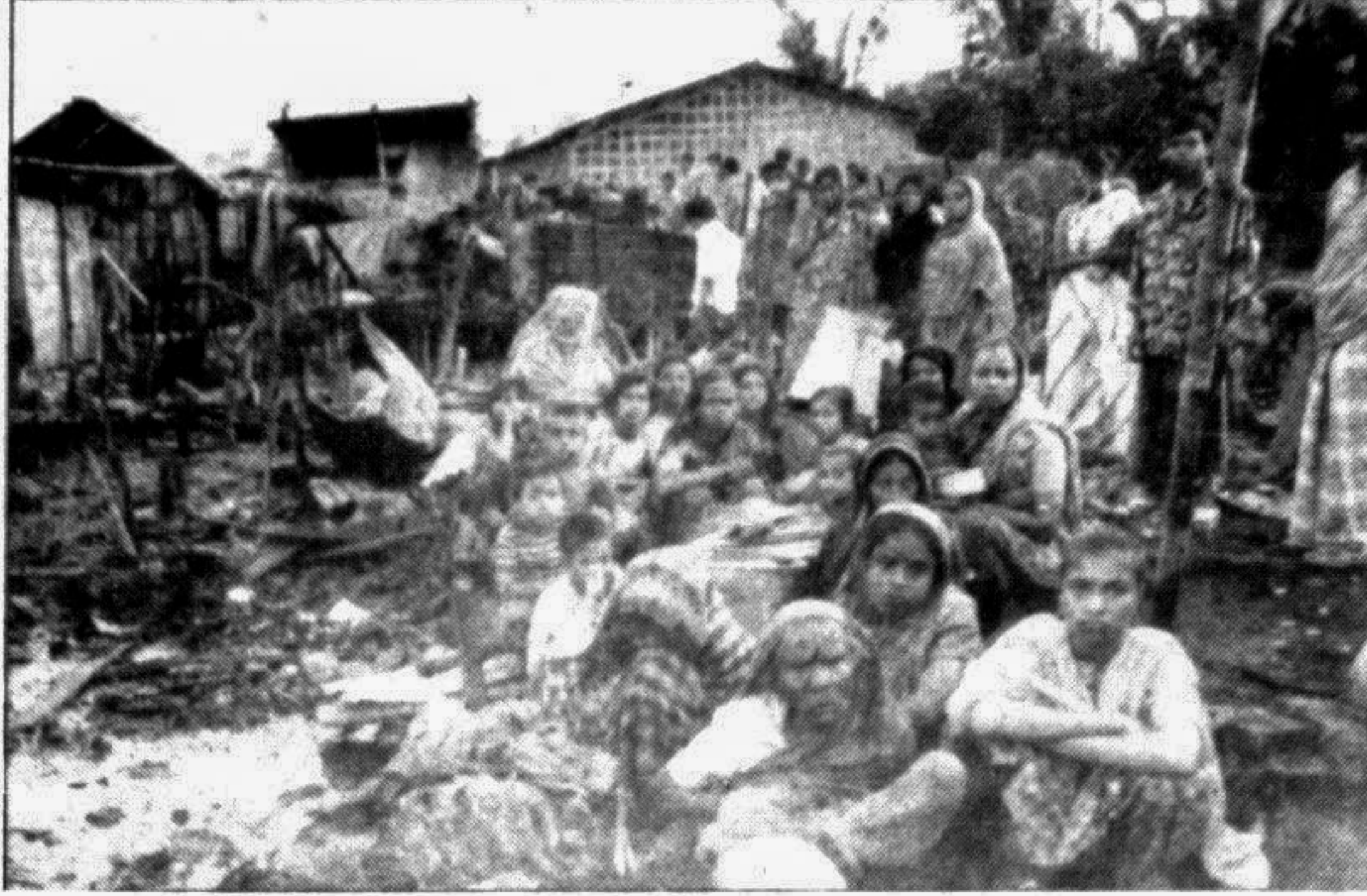
A devastating fire gutted some 200 dwellings in the Tikkipara slum of Mohammadpur in the city yesterday, leaving hundreds destitute.