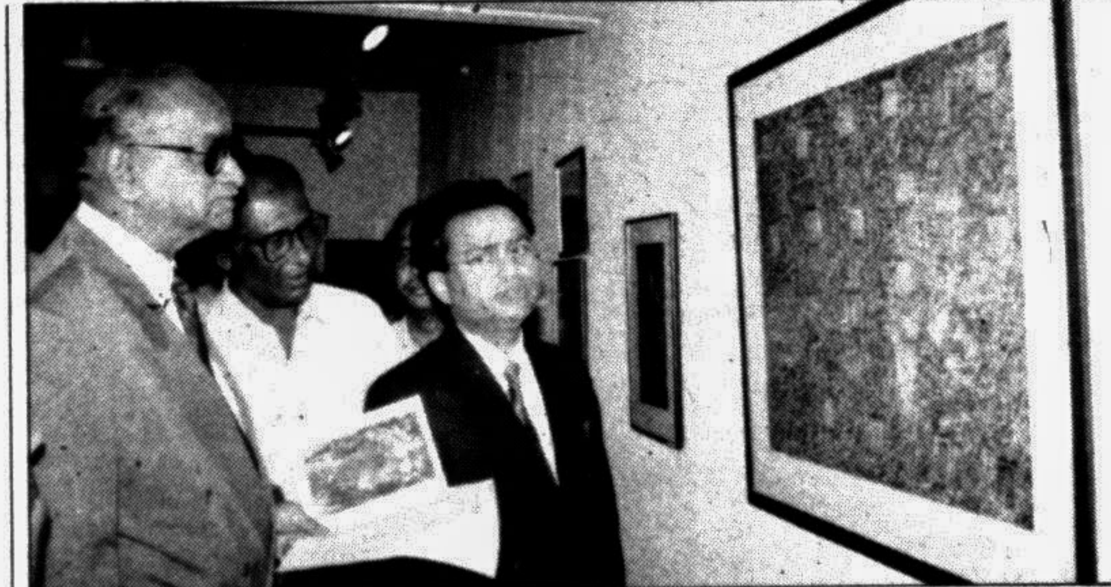
Foreign Minister A S M Mostafizur Rahman (L) looking at art works after inaugurating the 6th solo painting exhibition of Kazi Anower Hossain on Wednesday at Gallery Tone in the city. Alhaj Syed Abul Hossain (MPR) is also seen. The show will run until November 24.