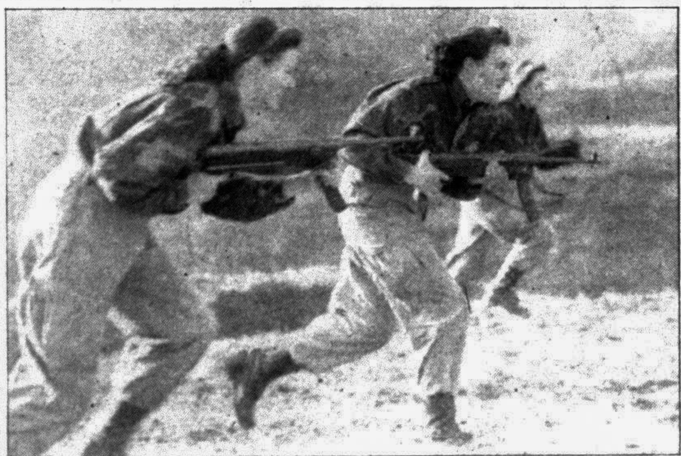
Bosnian female government soldiers practice on the outskirts of Sarajevo Tuesday last to prepare themselves to reinforce their troops along the frontlines in Bosnia-Herzegovina. It is the first time that Bosnian women practise the full range of training in preparation to join the army.