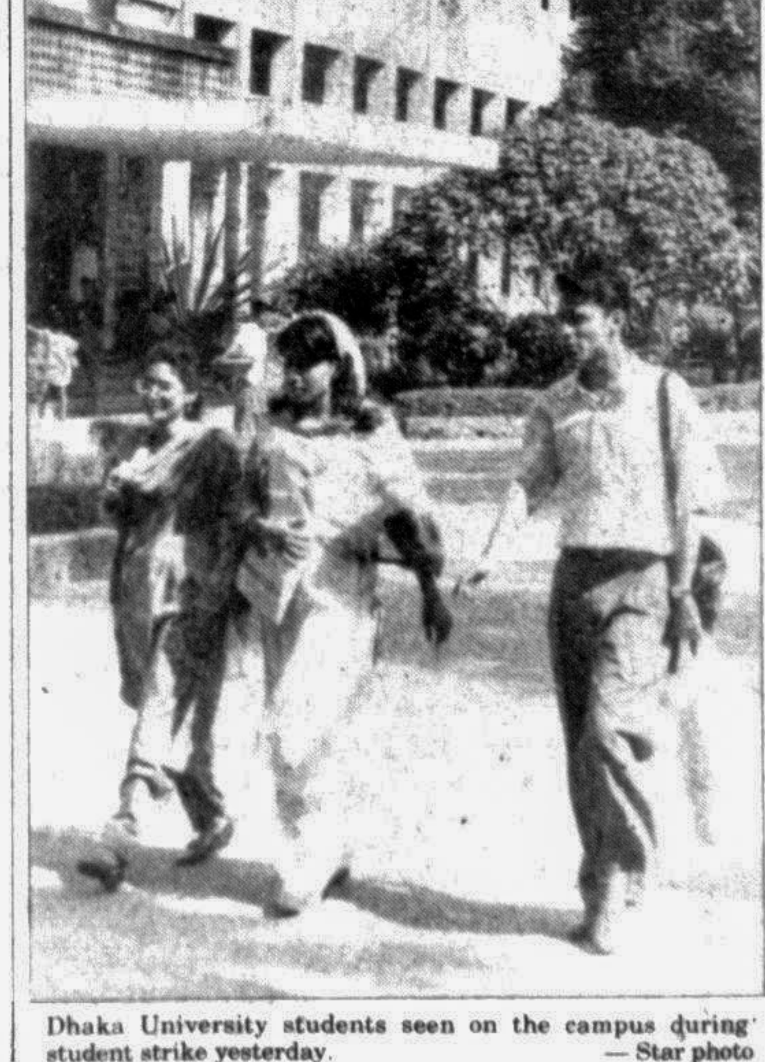
Dhaka University students seen on the campus during student strike yesterday.