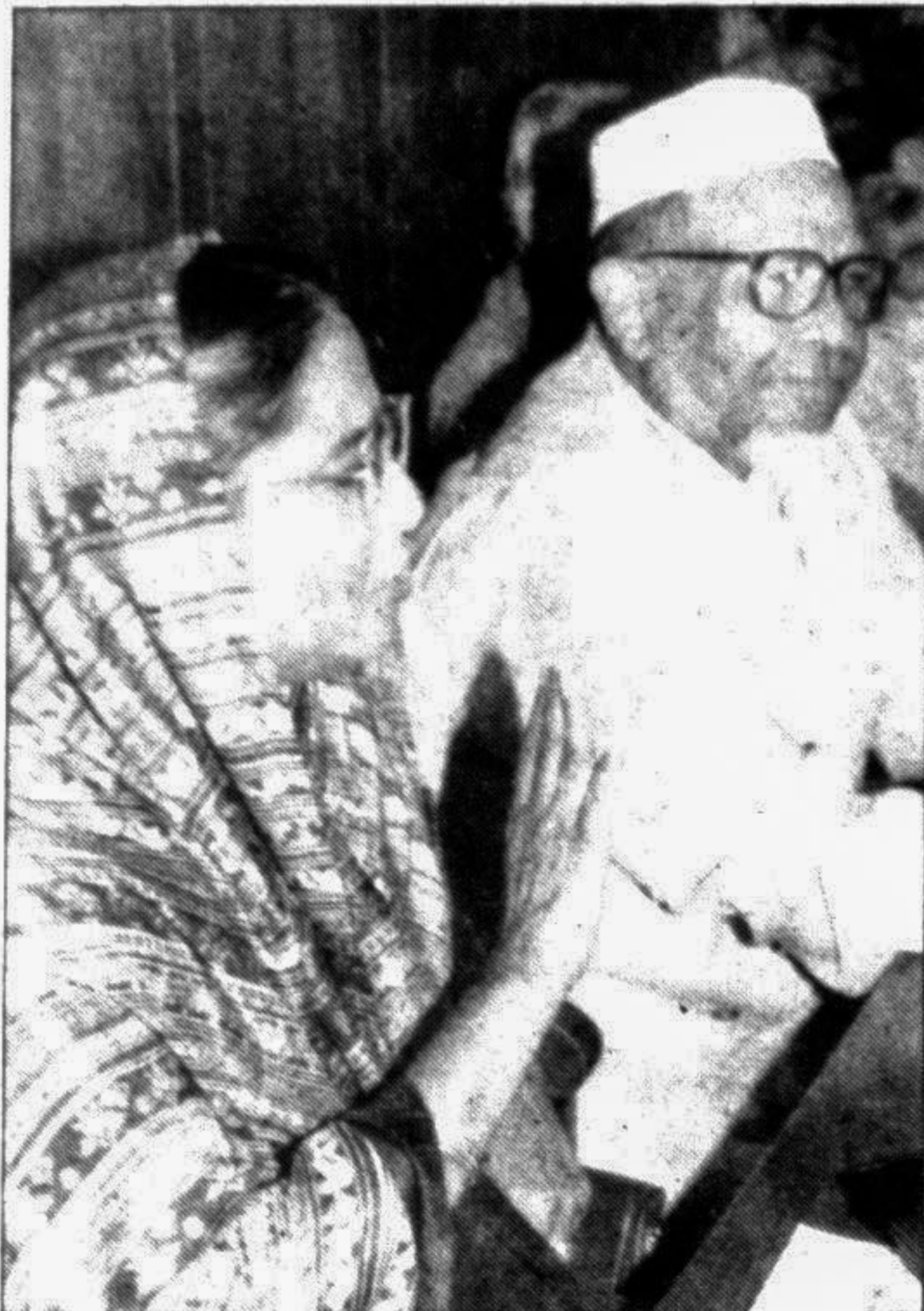
Awami League chief and Leader of the Opposition in Parliament Sheikh Hasina addressing a press conference at the Sangsad Bhavan yesterday. Deputy Leader of the Opposition Abdus Samad Azad is seen on her left