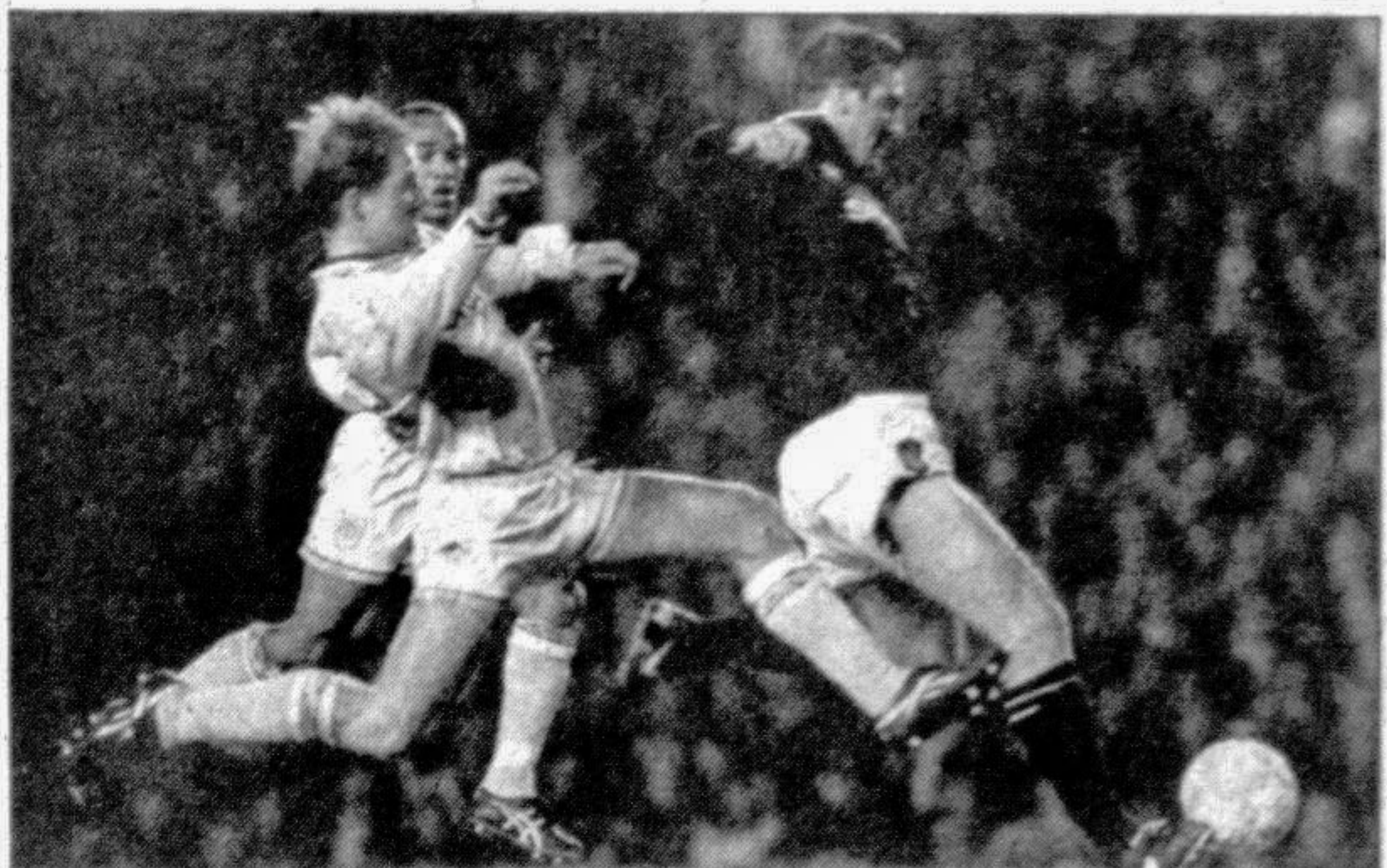
Manchester United's French international striker Eric Cantona dribbles past two Manchester City players during an English Premier league game on Nov 10. United won 5-0.

NEW SOUTH WALES: Mark Taylor (captain), Michael Slater, Mark Waugh, Michael Bevan, Shane Lee, Brad McNamara, Neil Maxwell, Gavin Robertson, Craig Glasscock, Anthony Kershner, Wayne Holdsworth, Richard Chee Quee (12th man). ENGLAND (likely): Mike Atherton, (captain), John Crawley, Graeme Hick, Graham Thorpe, Mike Gatting, Craig White, Steve Rhodes, Philli DeFreitas, Shaun Udal, Devon Malcolm, Phil Tufnell.