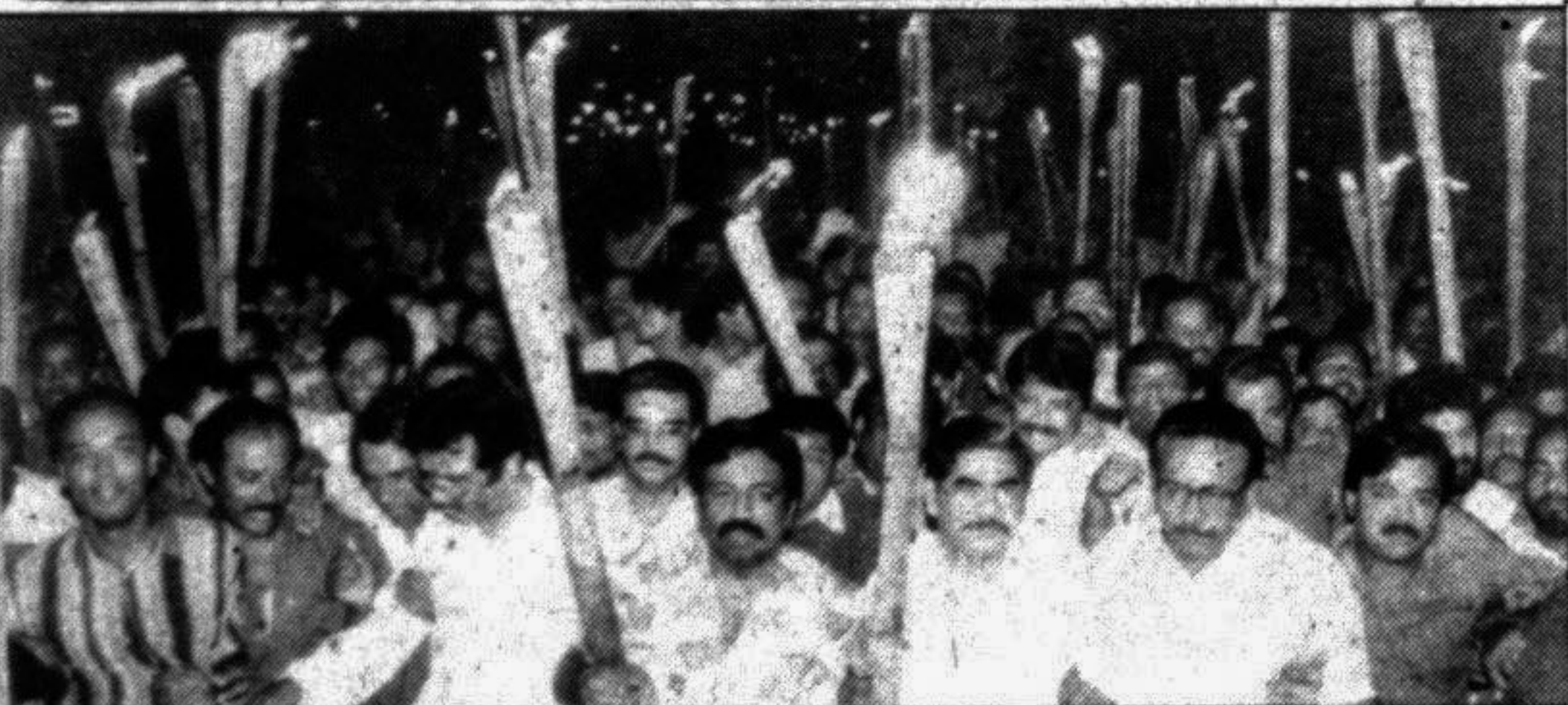
The Jatiya Party brought out a torch procession in the city yesterday to drum up support for today and tomorrow's dawn-to-dusk hartal.

OLD AIRPORT ROAD, DHAKA TEL : 325001-4, 817055, 817066 CDA AVENUE, CHITTAGONG TEL : 211224