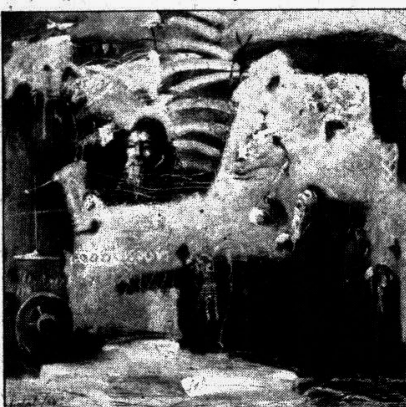
Retreat to the Roots-1