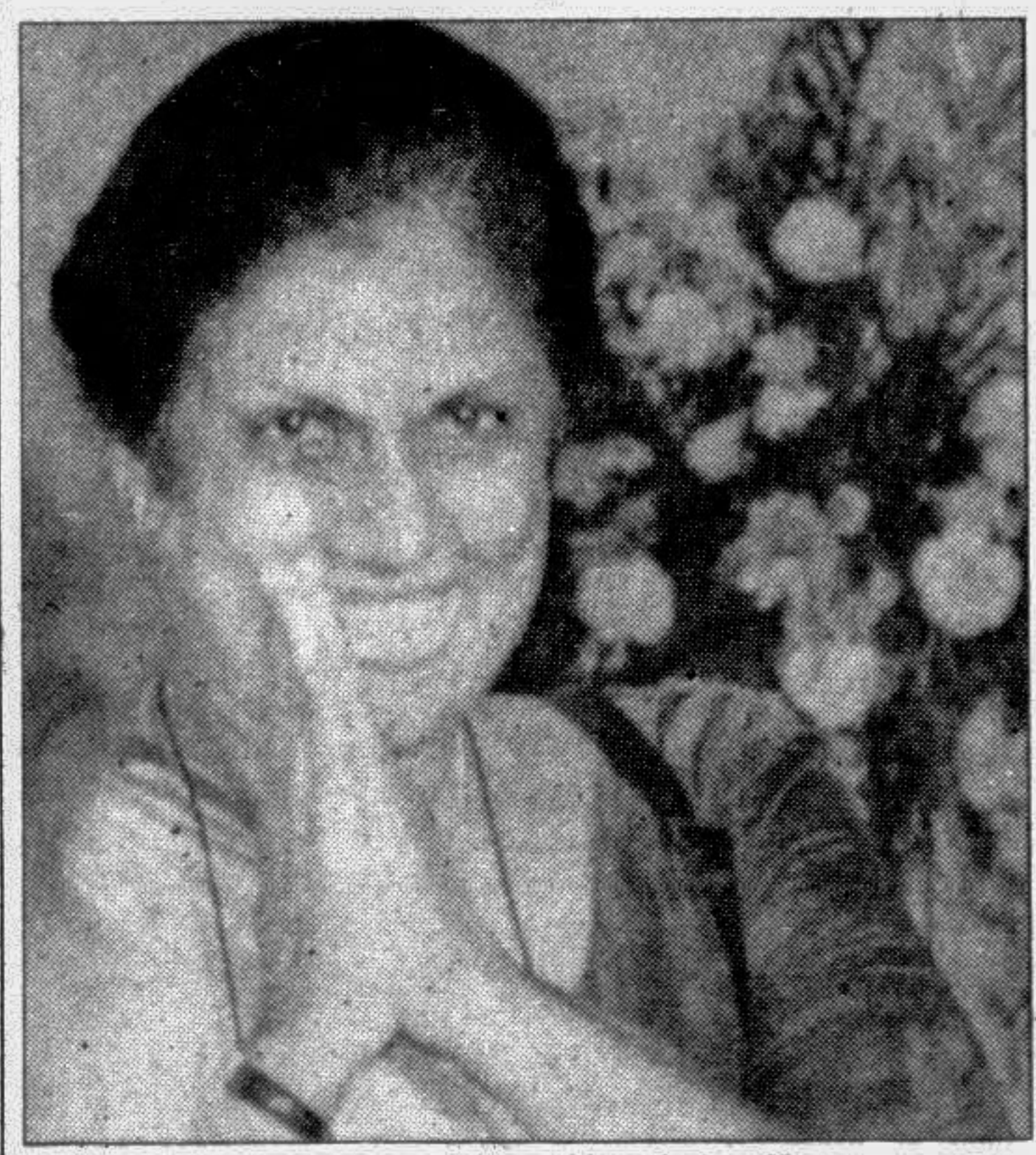
Sri Lankan president-elect Chandrika Kumaratunga clasps her hands in a traditional greeting in Colombo after being declared the winner yesterday

COLOMBO, Nov 10: Prime Minister Chandrika Kumaratunga won a landslide victory Thursday in a presidential election she called a referendum on the peace talks she began to try to end an 11-year war with Tamil rebels, reports AP. Her supporters set off firecrackers in the streets to celebrate, defying a nationwide curfew imposed by the military Wednesday night to stop