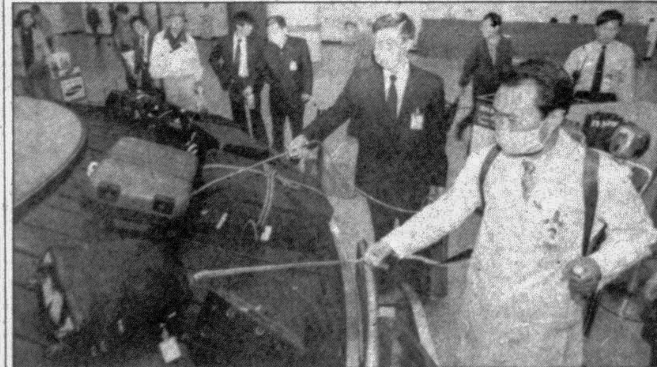
Health officials at Seoul's Kimpo Airport spray insecticide on luggage off a plane from Shanghai November 9 due to reports that flea-borne plague had broken out in southern China. All planes arriving from China are also treated with pesticides and disinfectants.

Viva voce and practical examination of final MSS last part course of the year 1991 in social science of the Dhaka University will be held according to the following time schedule: Roll 3971-4005 at 8 am, Roll 4006-4062 and 4101-4103 at 2:30 pm today. Practical examination on the thesis will begin at 9 am on November 14, reports BSS.